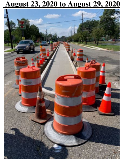
Figure 1: Concrete center island construction