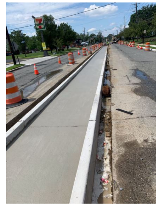
Figure 2: Concrete center island paver base

Lexa will continue with center cobblestone island work, roadway reconstruction, and preparation for paving operations on Chapel Ave. Daily traffic control will continue to be implemented for the duration of the project.