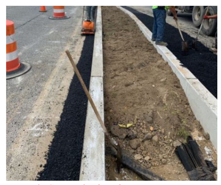
Figure 3: Center island roadway restoration