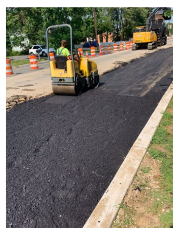
Figure 5: Roadway reconstruction