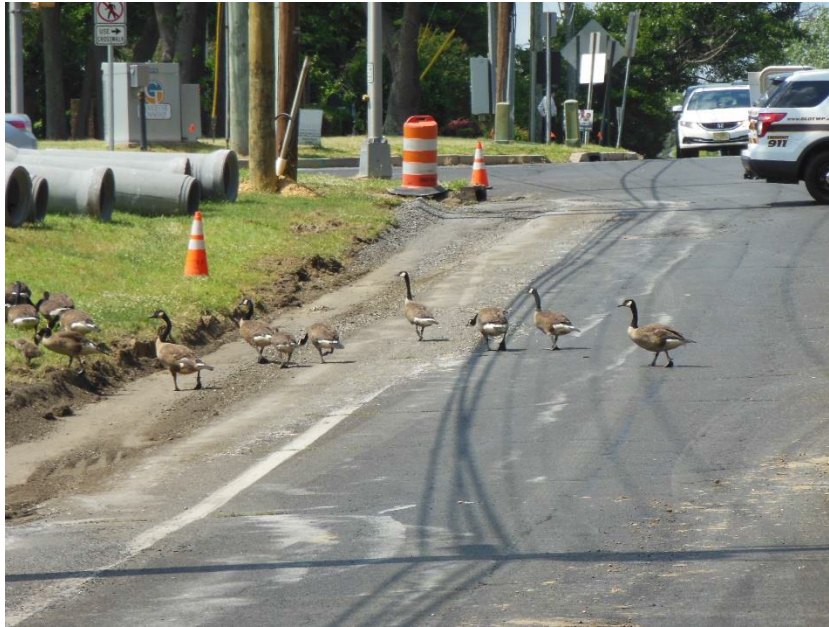
Figure 2 Geese in the area crossing the road near College Drive