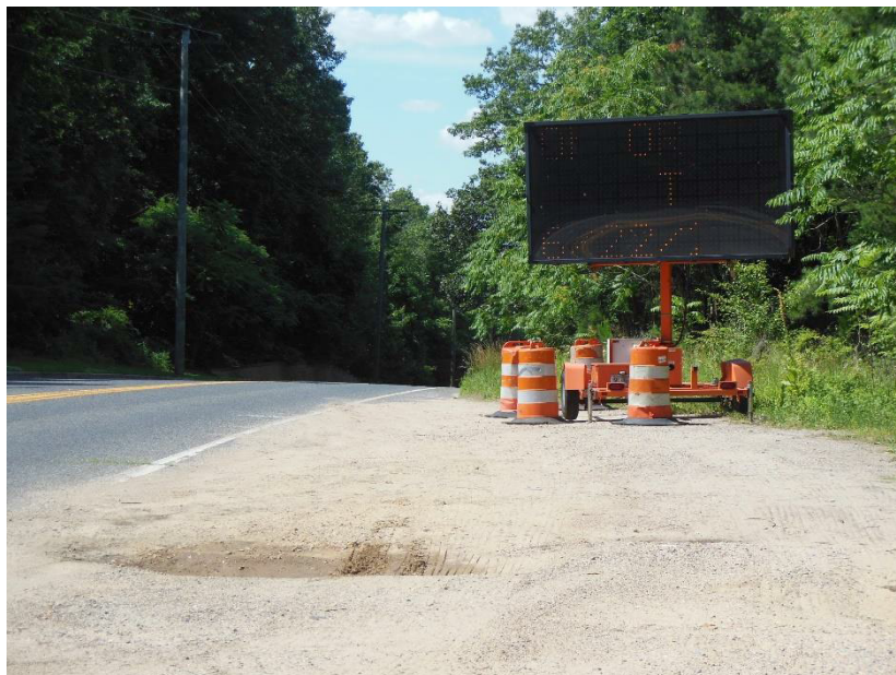
Figure 3 VMS was moved to a safer location around Sta. 67+00 Lt.