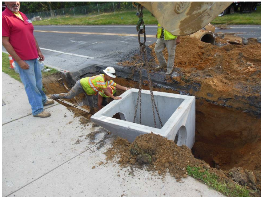
Figure 5 Installation of Type B inlet at Sta. 35+45.16 Rt.