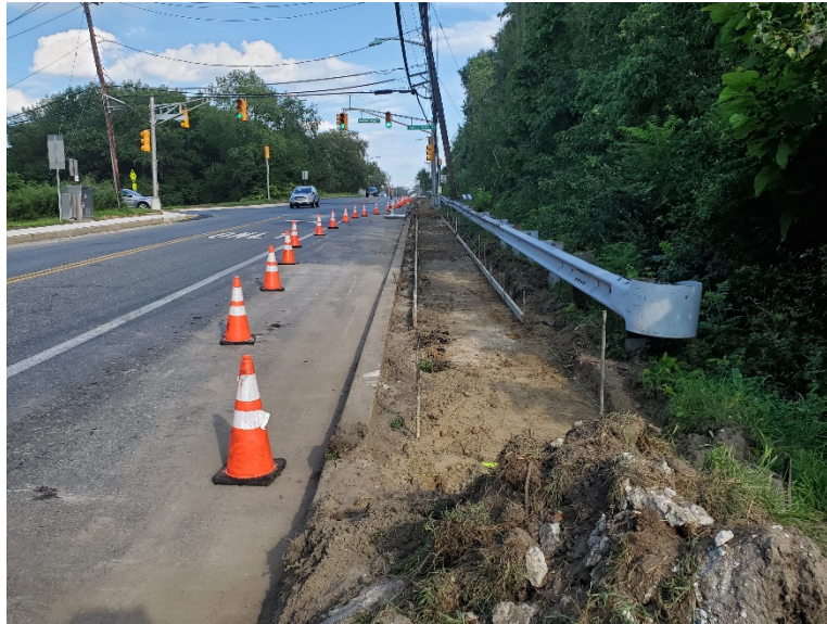
Figure 8 Forms erected and left overnight for use in future workday