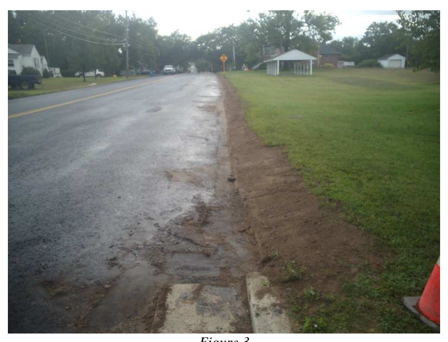
Figure 3 Turf repair along Pennington Ave. South side from Old White Horse Pike to Route 30.