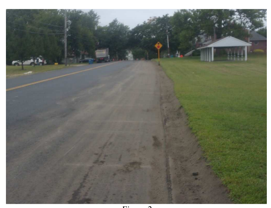
Figure 2 Preparing areas along Pennington Ave. for Turf repair from Old White Horse Pike to Route 30.

consulting engineer services Engineers, Planners, and Land Surveyors