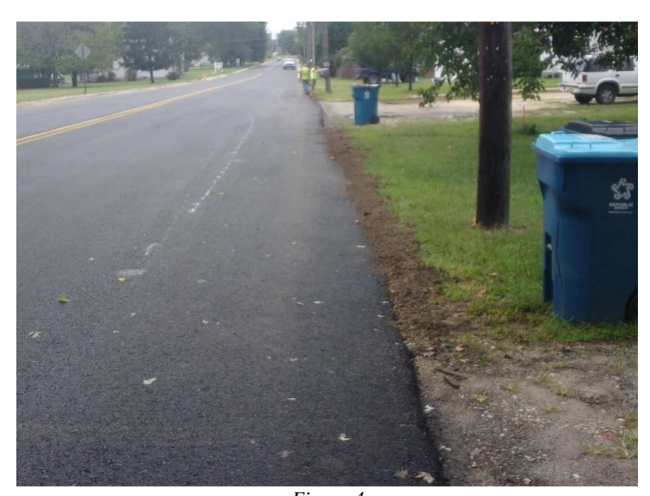
Figure 4 Turf repair along Pennington Ave. South side from Old White Horse Pike to Route 30.