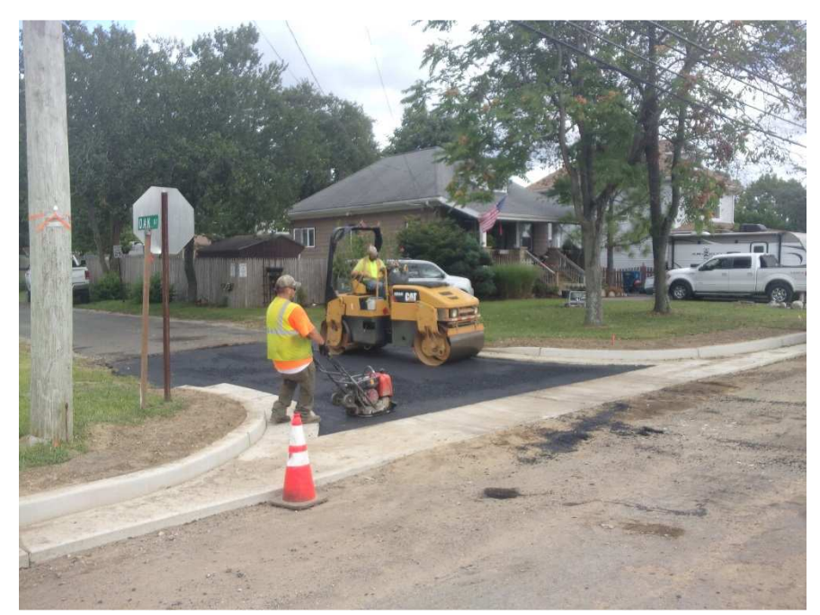
Figure 4 Oak Street base paved behind gutter.