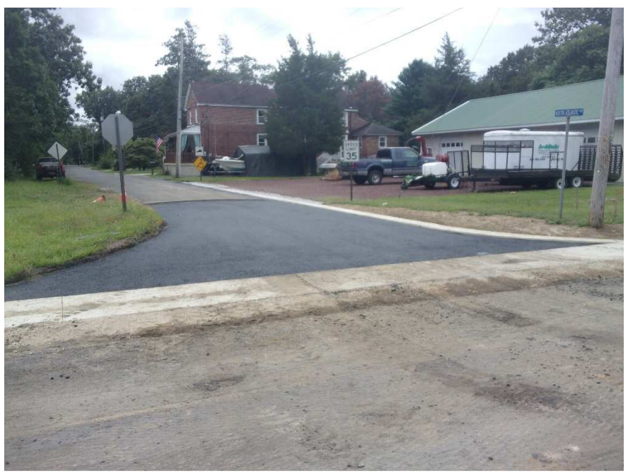
Figure 7 South Atlantic Street base paved behind gutter.