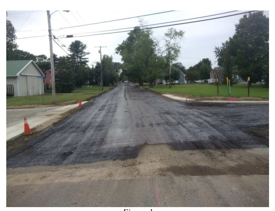
Figure 1 Pennington Ave. West of R.R. tracks Sta. 6+10 to 11+40 both sides of roadway milled to grade and profile and tacked for dust.

Weekly Progress Report #11 Aug. 31, 2020 to Sept. 04, 2020