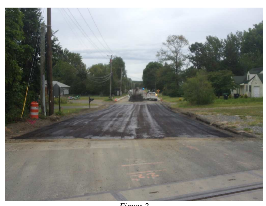
Figure 2 Pennington Ave. East of R.R. tracks Sta. 12+50 to 13+50 both sides of roadway milled to grade and profile and tacked for dust