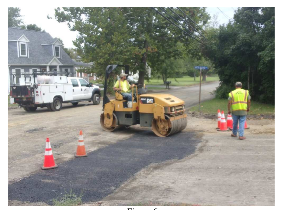
Figure 6 South Second Street base repair.