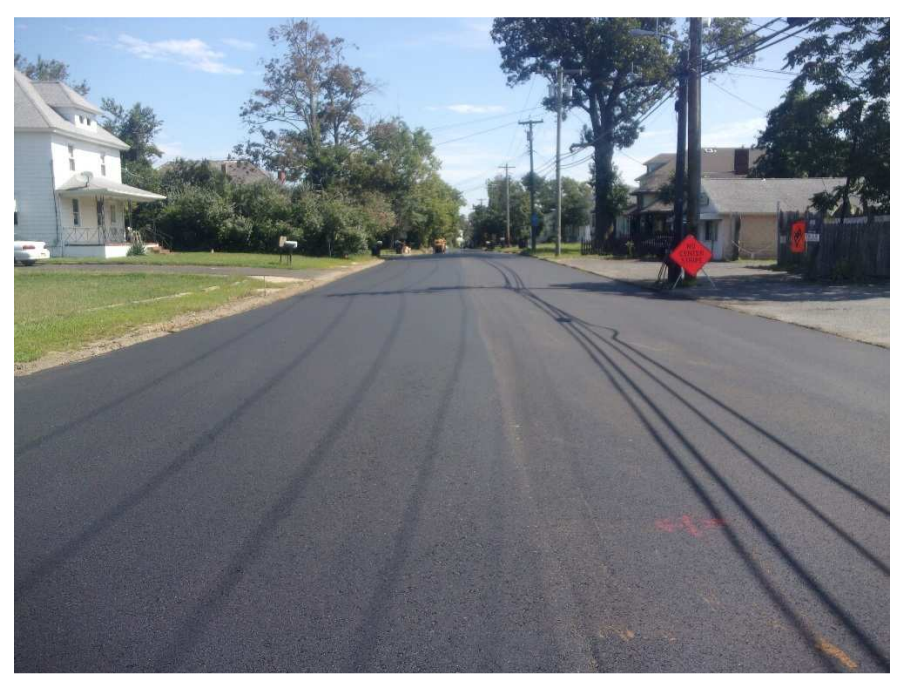
Figure 9 Base paving Pennington Ave. West of Railroad tracks