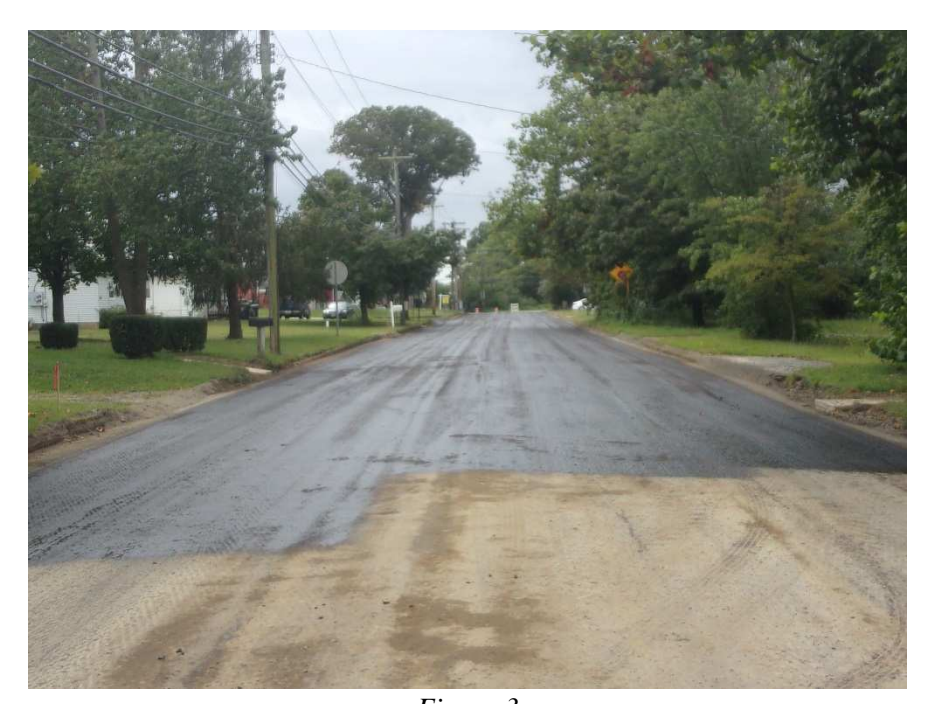
Figure 3 Pennington Ave. Sta. 0+22 to 6+10 both sides of roadway milled to grade and profile and tacked for dust