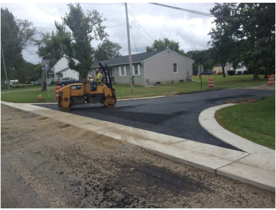
Figure 5 Maple Ave. base paved behind gutter.