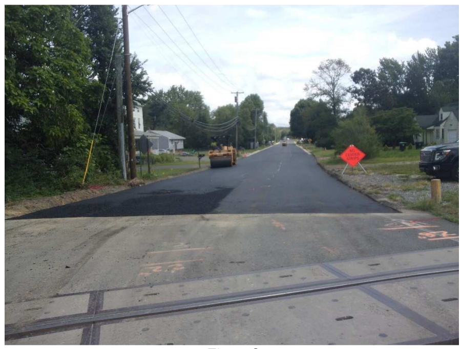
Figure 8 Base paving Pennington Ave. East of Railroad tracks