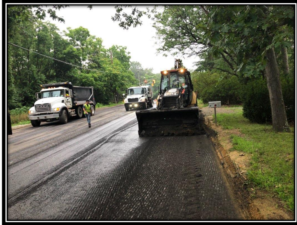
Figure: 2 – Clearing of edge of paving after completion of milling in the northbound lane Berlin-Clementon Road and Berlin-Cross Keys Road in the Borough of Berlin