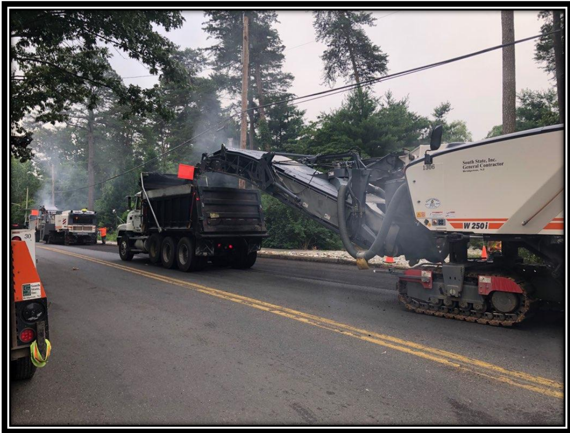
Figure: 1 – HMA milling in the southbound lane between Berlin-Clementon Road and Berlin-Cross Keys Road in the Borough of Pine Hill