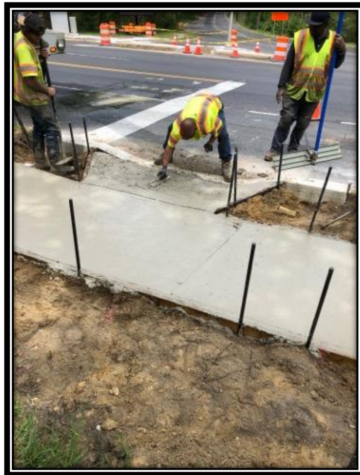
Figure: 1 – Installation of ADA ramp at the southwest corner of the intersection Watsonstown-New Freedom Road (CR 691) and Berlin-Clementon Road in the Borough of Clementon