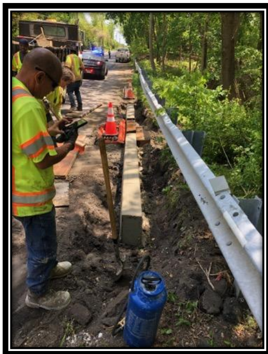
Figure: 3 – Installation of concrete curb adjacent to the newly reconstructed type 'B' inlet in the southbound lane between Berlin-Clementon Road and Berlin-Cross Keys Road