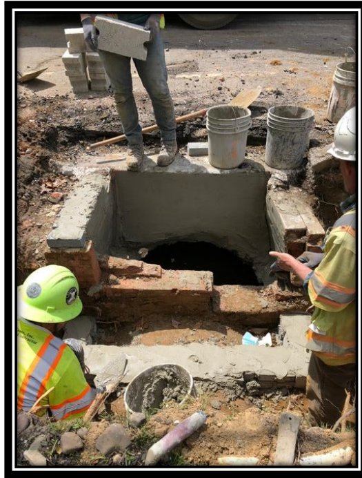
Figure: 2 – Reconstruction of existing inlet in the northbound lane of Watsontown-New Freedom Road (CR 691) between the White Horse Pike and Berlin-Clementon Road in the Borough of Clementon