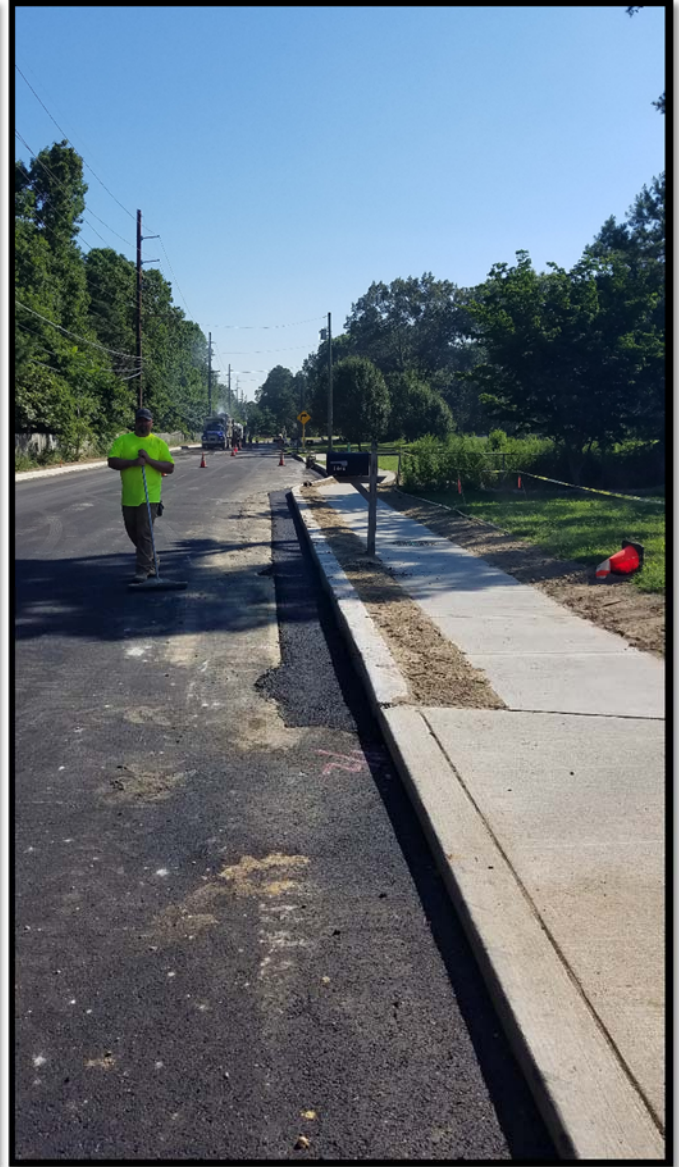
Photograph 3 – New concrete vertical curb installed between stations 128+00R and 132+00R.