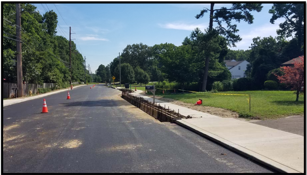
Photograph 1 – Forms in place for concrete vertical curb between stations 128+00R and 132+00R.