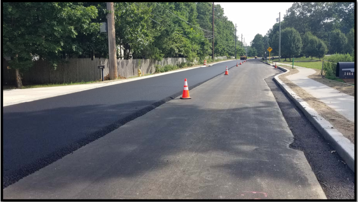
Photograph 9 – The left side of Jarvis Road was top paved between stations 91+47 and 144+90 (Kearsely Road).