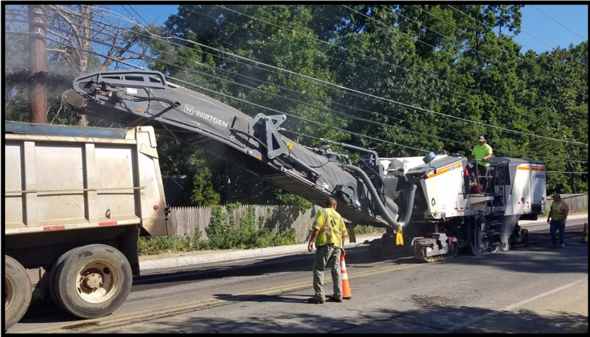
Photograph 4 – The paving crew is milling Jarvis Road from station 133+00 to Kearsley Road.