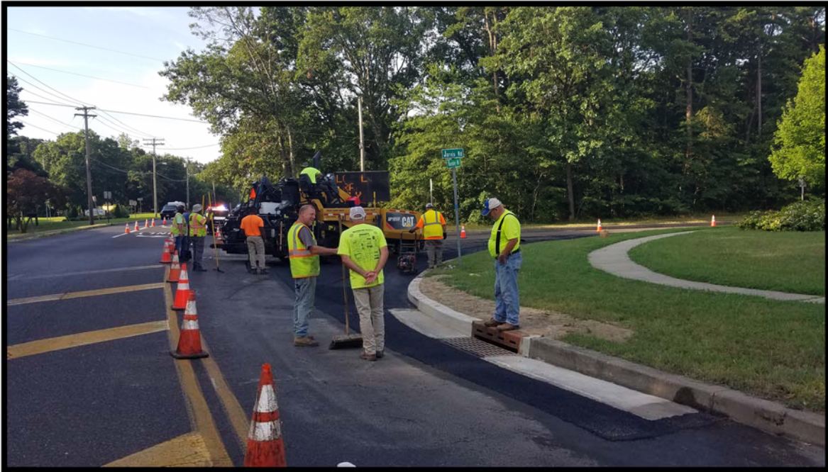
Photograph 6 – Jarvis Road being top paved with Hot Mix Asphalt at the intersection of Kearsley Road.