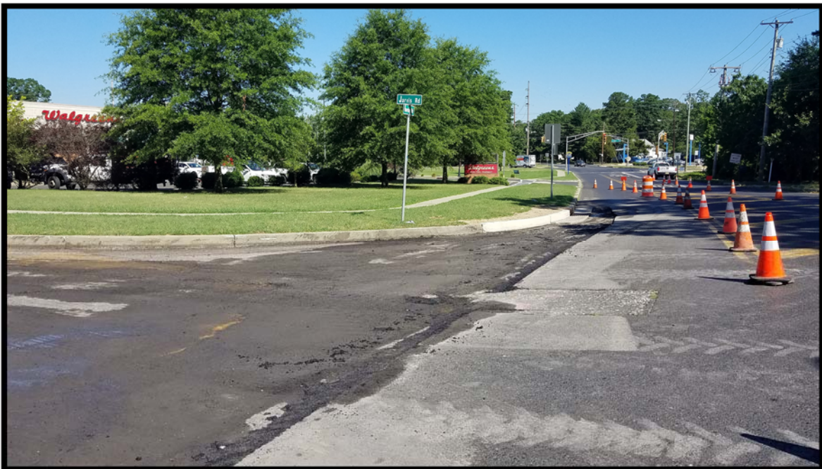
Photograph 5 – Jarvis Road milled at the intersection of Kearsley Road.