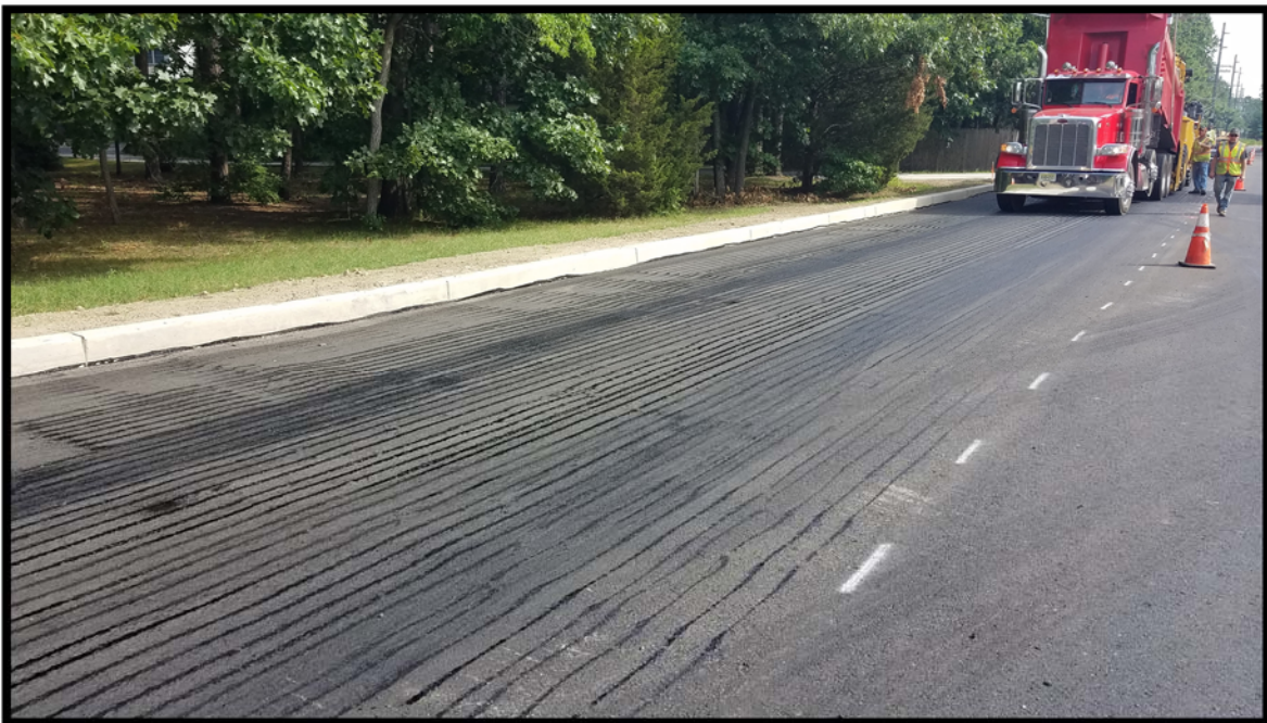
Photograph 7 – Tack Coat applied on roadway and polymer joint adhesive applied to curb before top paving Jarvis Road with Hot Mix Asphalt.