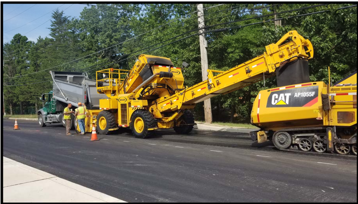
Photograph 9 – Materials Transfer Vehicle (MTV) delivering Hot Mix Asphalt from the hauling truck to the paver.