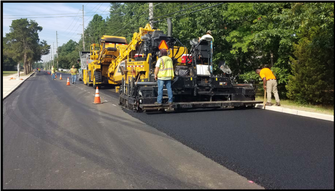
Photograph 8 – Hot Mix Asphalt Top Paving being installed on Jarvis Road.