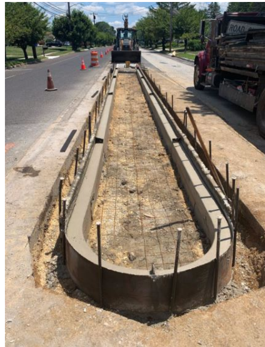
Figure 3: Concrete island curb placed