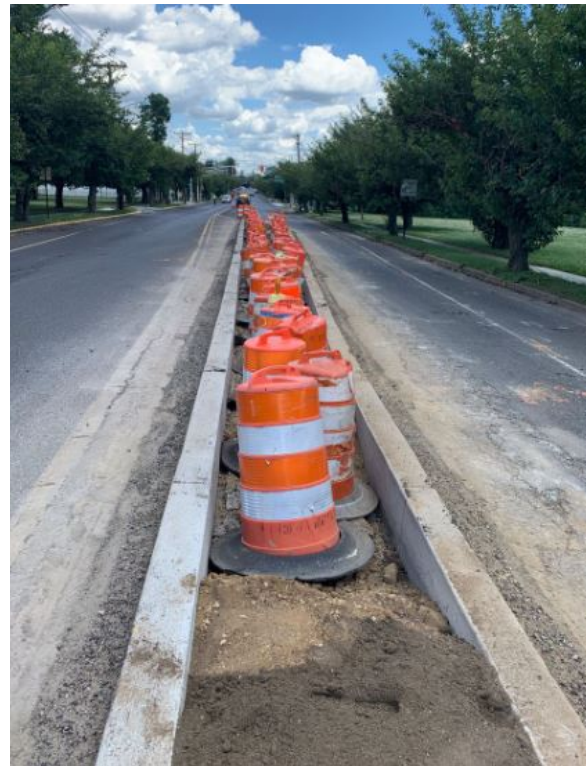
Figure 5: Concrete center island construction