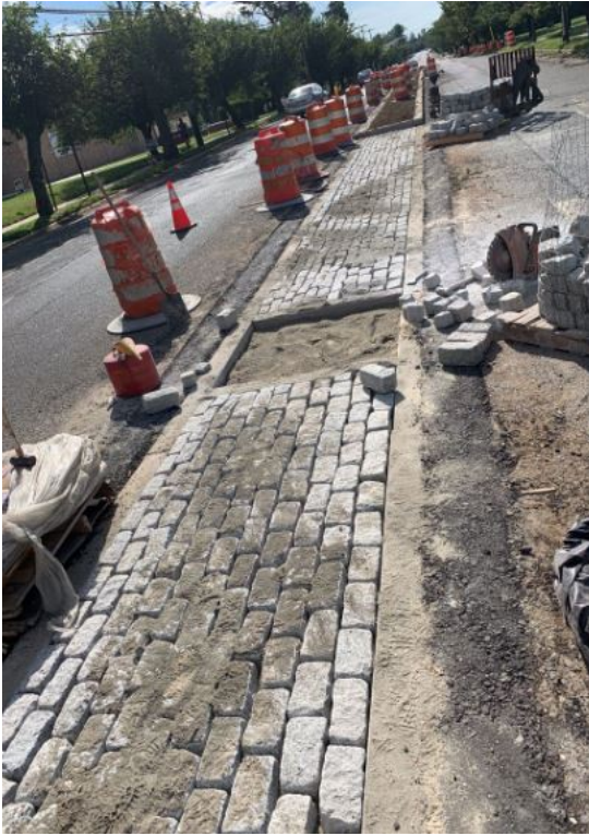
Figure 4: Concrete center island cobblestone construction