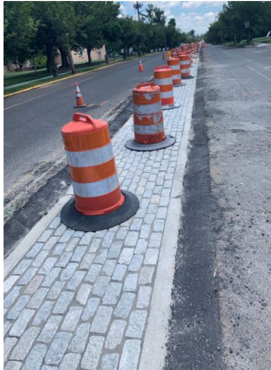
Figure 1: Concrete center island