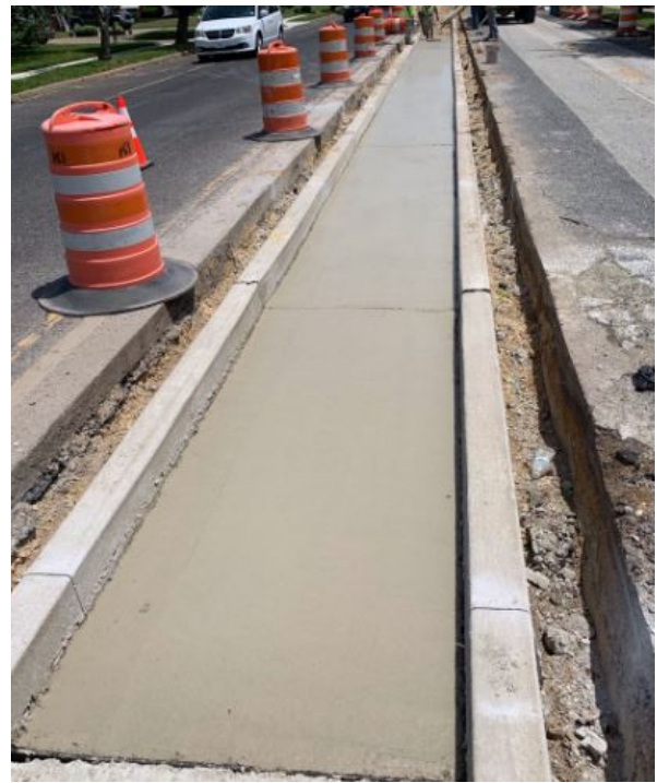
Figure 3: Concrete island base placed