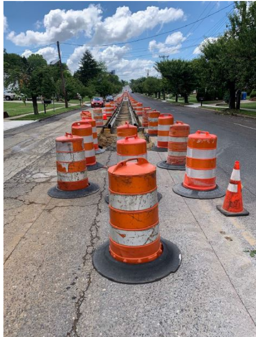
Figure 1: Concrete island construction