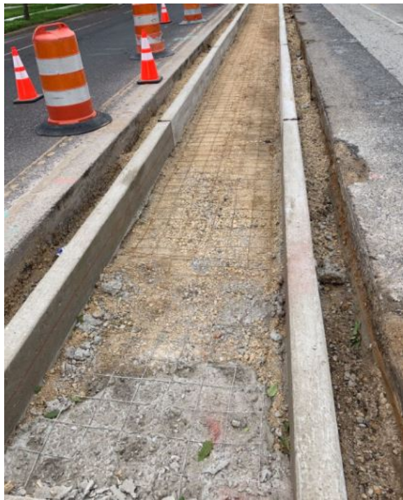
Figure 2: Concrete island reinforced subbase

Lexa will continue with the removal of existing roadway and installation of concrete islands as specified in the plans along Chapel Avenue. Daily traffic control will continue to be implemented for the duration of the project. An onsite progress meeting will be held on June 22, 2020 to review all project related activities.