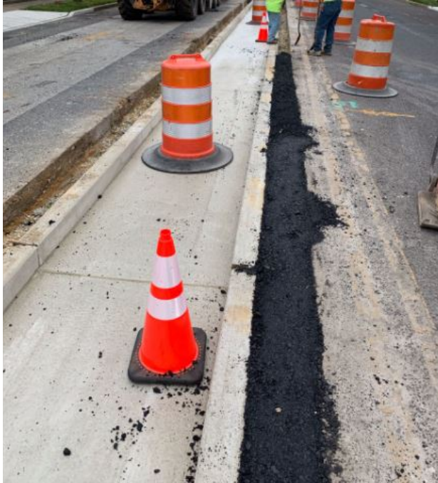
Figure 4: Roadway restoration