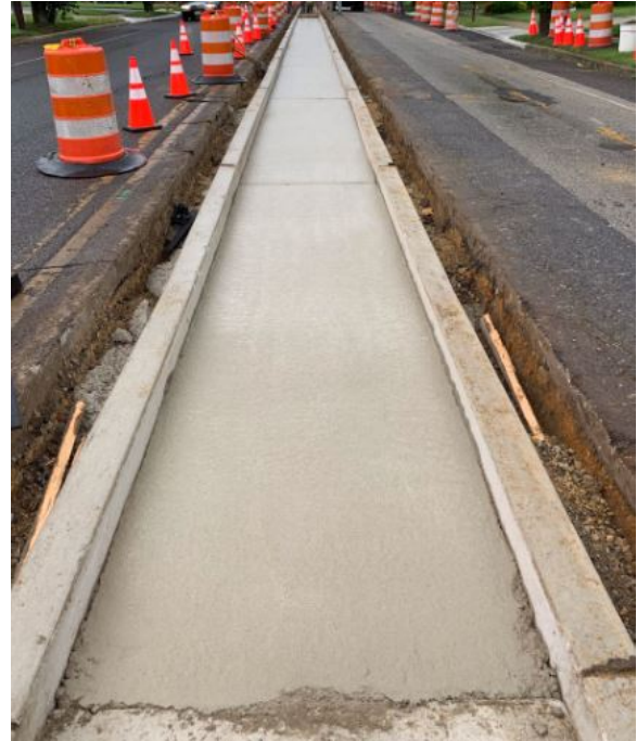
Figure 5: Concrete island base placed