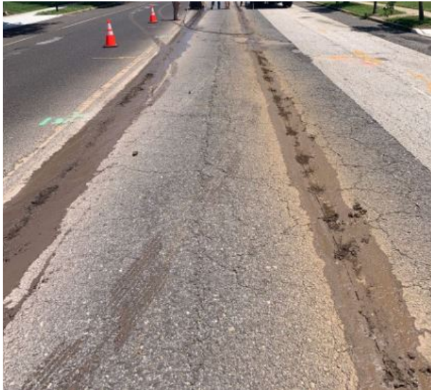
Figure 2: Sawcuts for concrete island

Lexa will continue with the removal of existing roadway and installation of concrete islands as specified in the plans along Chapel Avenue. Daily traffic control will continue to be implemented for the duration of the project.