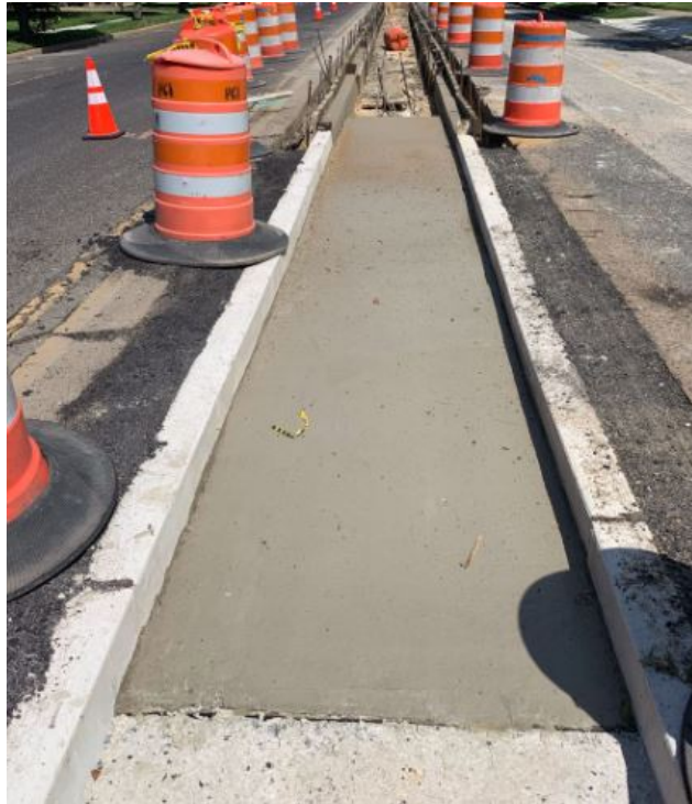
Figure 1: Concrete island construction