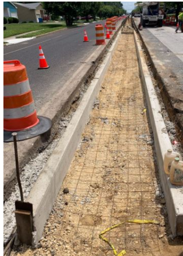
Figure 3: Concrete island subbase