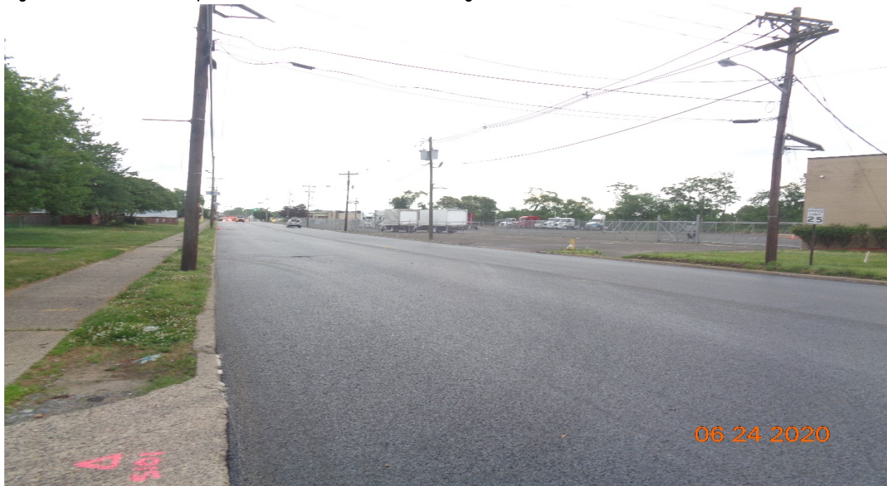
Figure 8: Stone Matrix Asphalt 12.5 MM Surface Course along Westfield Avenue between STA 133+64 – 109+50.