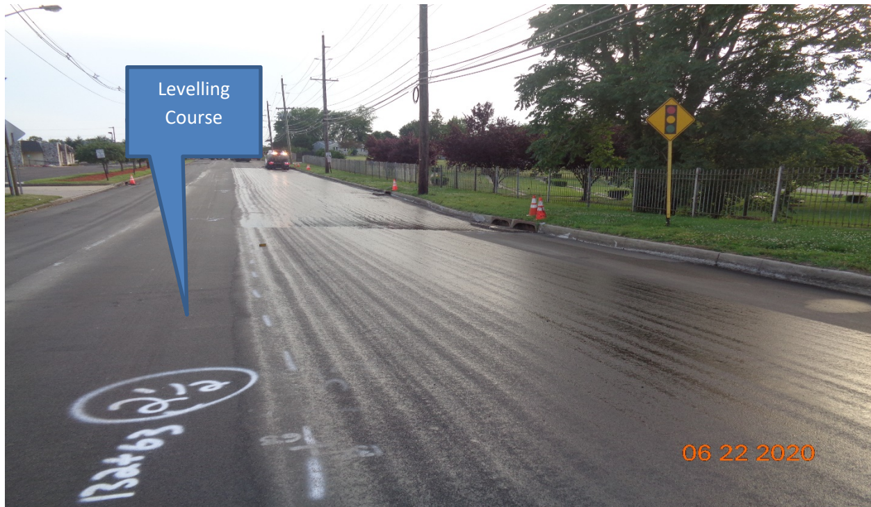
Figure1: Stone Matrix Asphalt 12.5 MM Surface Course along Westfield Avenue between STA 133+64 – 109+50.