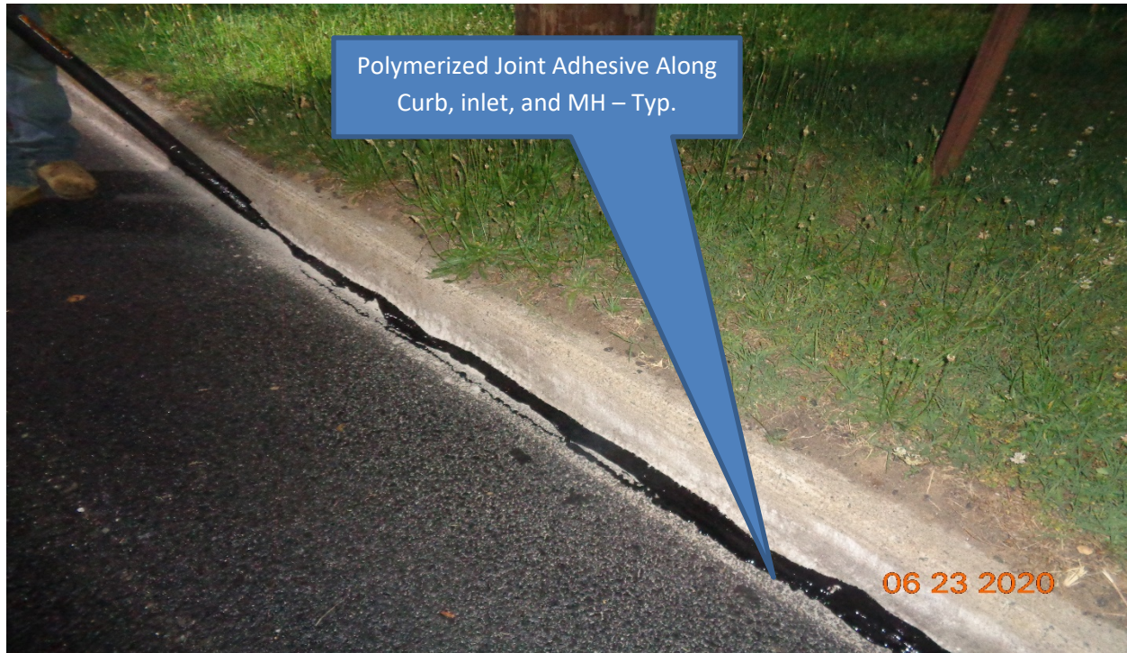
Figure 3: Stone Matrix Asphalt 12.5 MM Surface Course along Westfield Avenue between STA 133+64 – 109+50.