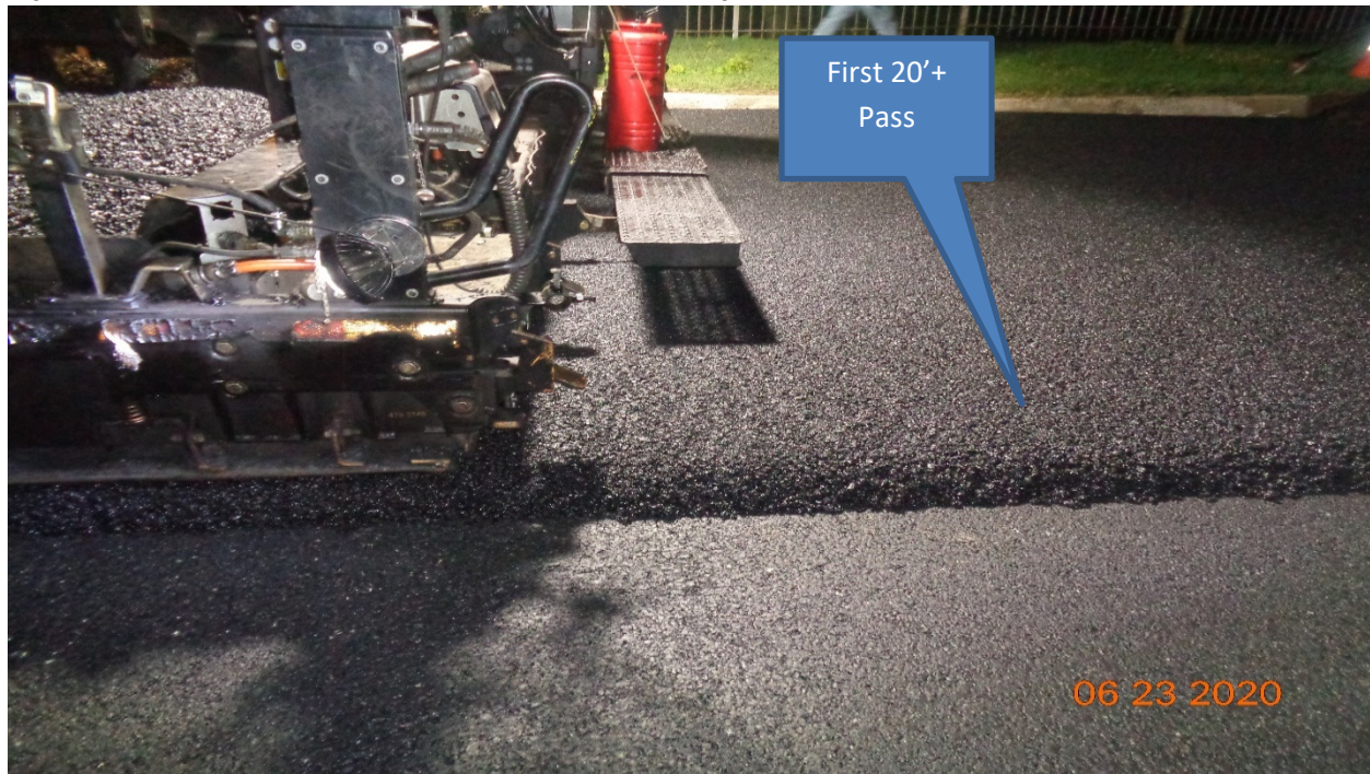
Figure 4: Stone Matrix Asphalt 12.5 MM Surface Course along Westfield Avenue between STA 133+64 – 109+50.