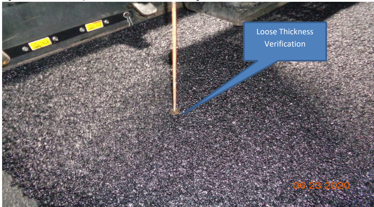
Figure 6: Stone Matrix Asphalt 12.5 MM Surface Course along Westfield Avenue between STA 133+64 – 109+50.