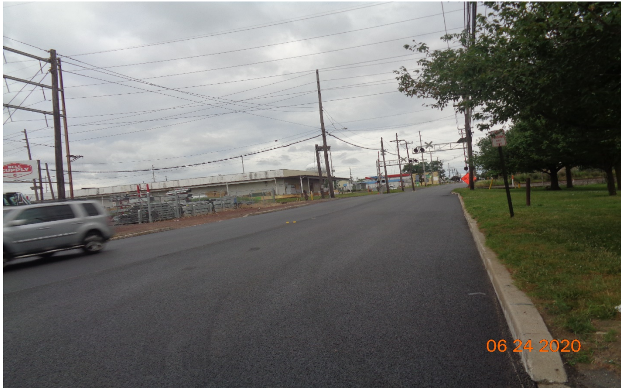
Figure 7: Stone Matrix Asphalt 12.5 MM Surface Course along Westfield Avenue between STA 133+64 – 109+50.