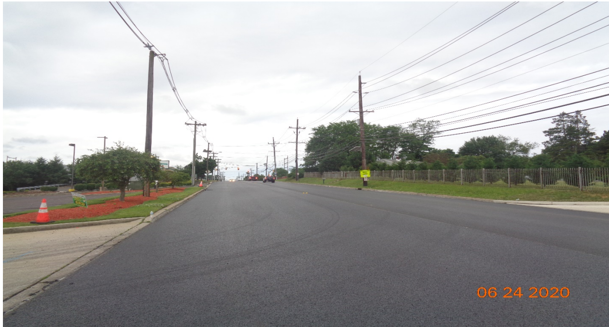
Figure 6: Stone Matrix Asphalt 12.5 MM Surface Course along Westfield Avenue between STA 133+64 – 109+50.