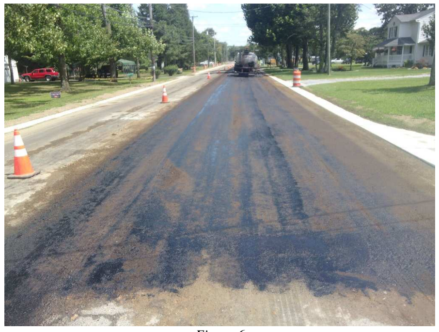
Figure 6 Full depth reclamation of the Right side of Pennington Ave. Sta. 16+50 to 27+80.