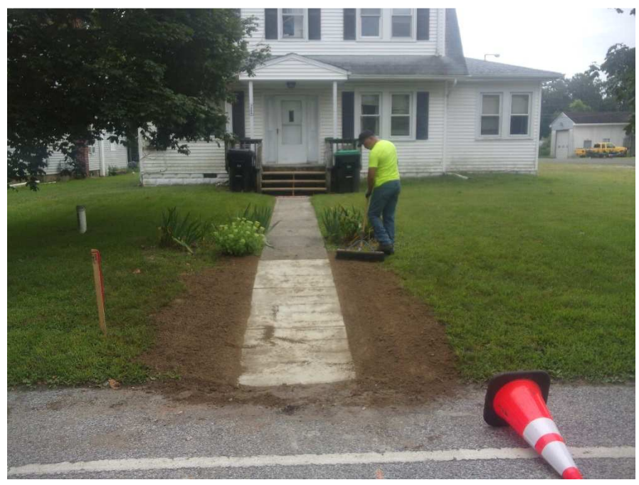
Figure 3 Typical turf repair at service walks along Pennington Avenue.