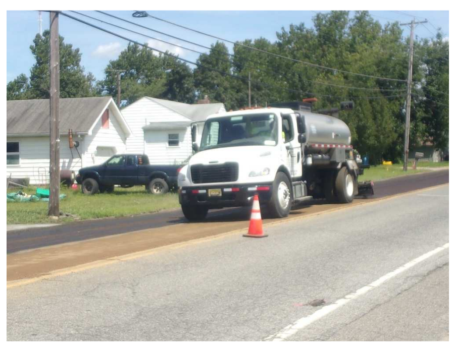
Figure 5 Full depth reclamation of the Left side of Pennington Ave. Sta. 15+00 to 27+80.