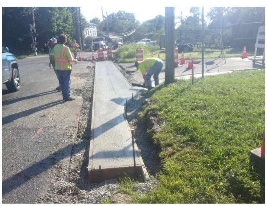
Figure 1 Concrete gutter installed Pennington Ave .and South Atlantic Ave..

Weekly Progress Report #9 Aug. 17, 2020 to Aug. 21, 2020