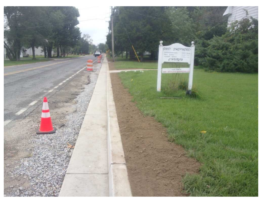
Figure 4 Typical turf repair behind curb and gutters along Pennington Avenue.