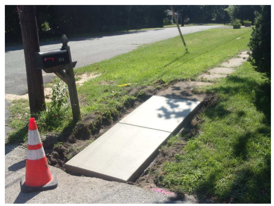
Figure 2 Typical sidewalk installation along Pennington Avenue.