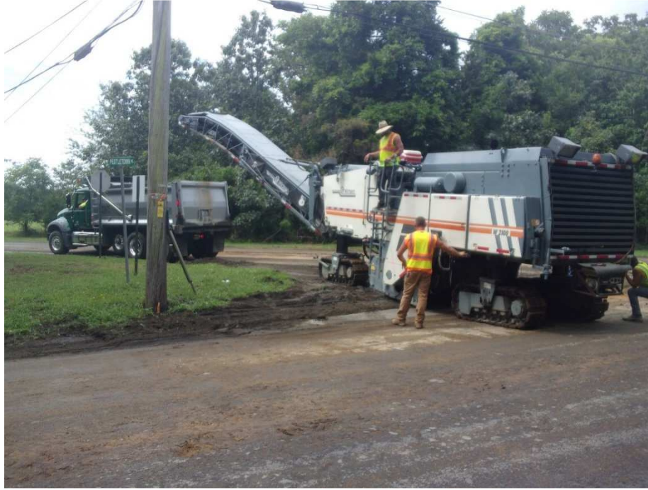
Figure 4 Milling to subgrade at Pestletown and Chew Rd