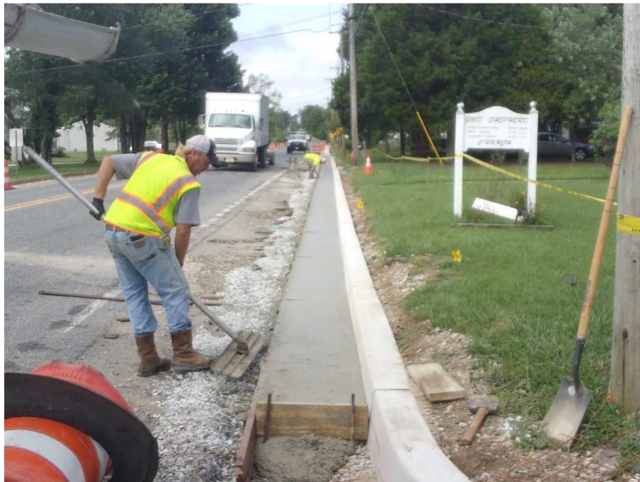
Figure 5 Concrete Gutter and Monolithic Curb and gutter installed Sta. 18+30 to 21+13 left Pennington Ave.