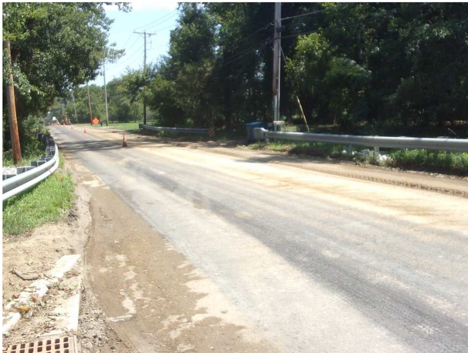
Figure 3 Milling to subgrade along Chew Road.