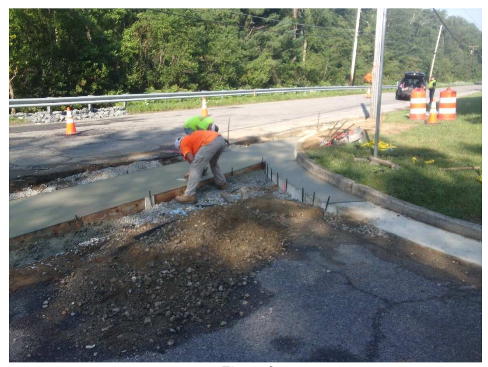
Figure 6 Concrete Gutter and Curb installed Northwest Corner Condo Ave. and Chew Rd.