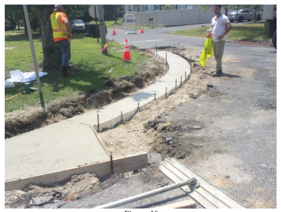
Figure 10 Concrete gutter installed Station Eastern corner of Maple Ave