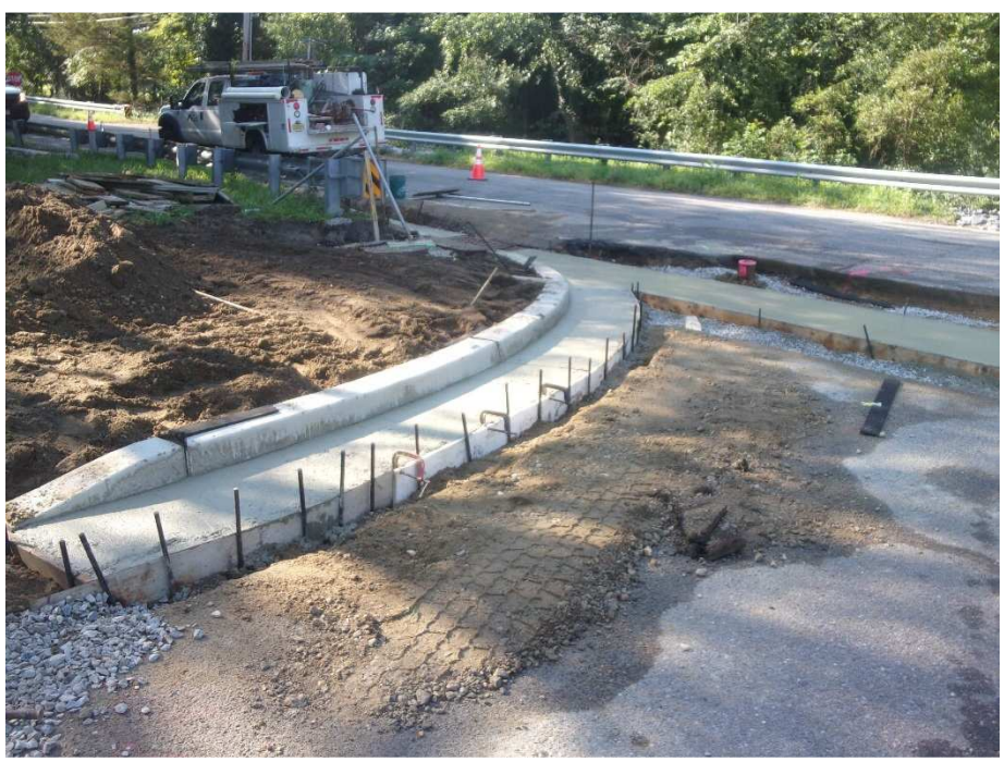
Figure 5 Concrete Gutter and Curb installed Northeast Corner Condo Ave. and Chew Rd.