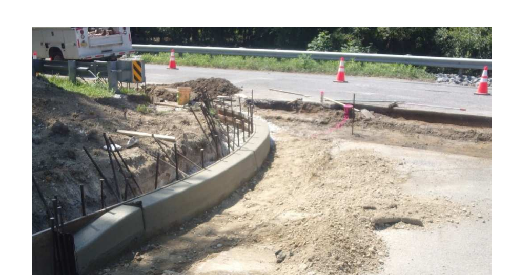
Figure 4 Curb installed Northeast corner Condo Ave. and Chew Road

consulting engineer services Engineers, Planners, and Land Surveyors