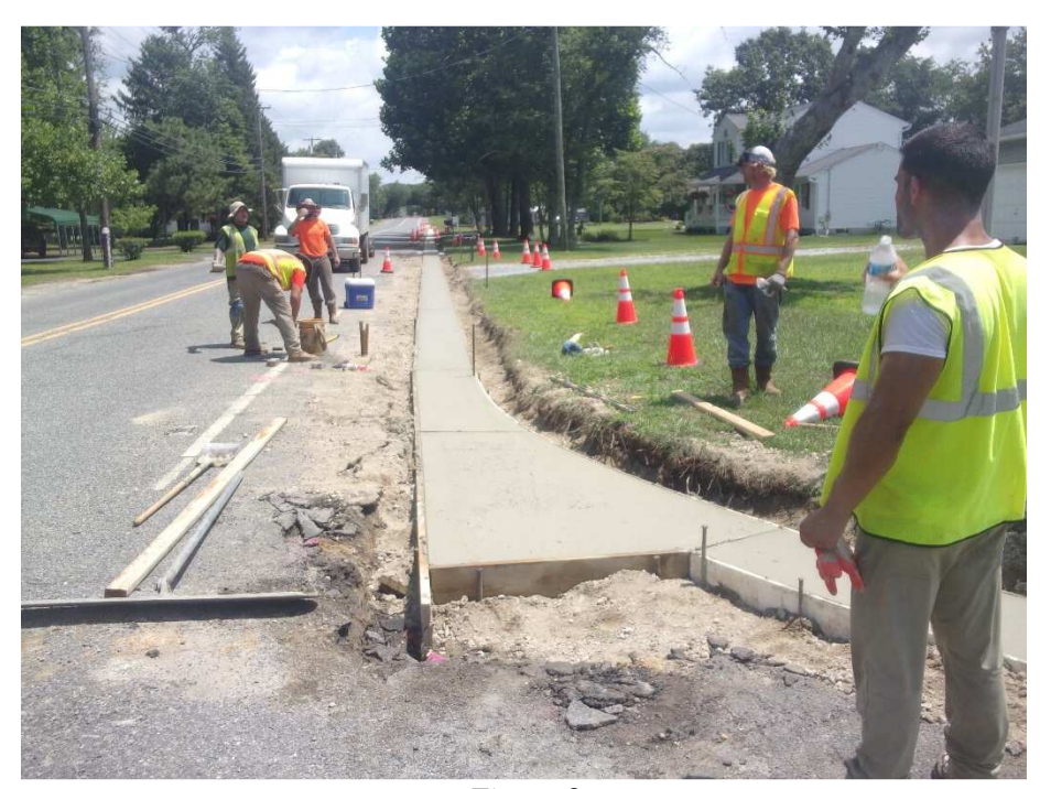
Figure 9 Concrete gutter installed Station 18+50 to Maple Ave. right side of Pennington Ave