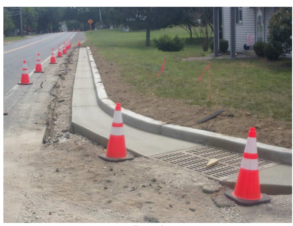
Figure 1 Concrete gutter installed Pennington Ave. right Station 23+00 to Oak St.

Weekly Progress Report # 4 July 20, 2020 to July 24, 2020