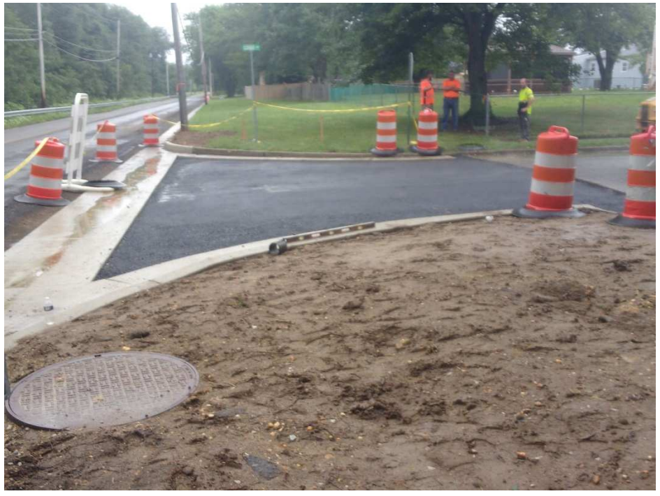
Figure 11 Base pave Condo Ave. behind gutter