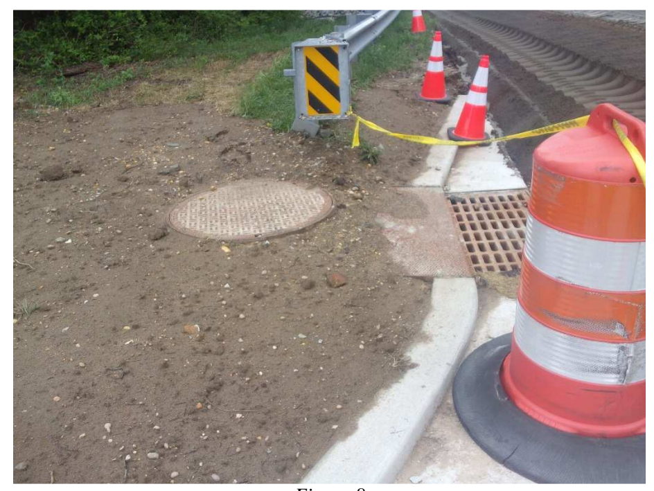
Figure 8 Set Square framed Manhole Casting Corner of Condo Ave. and Chew Road