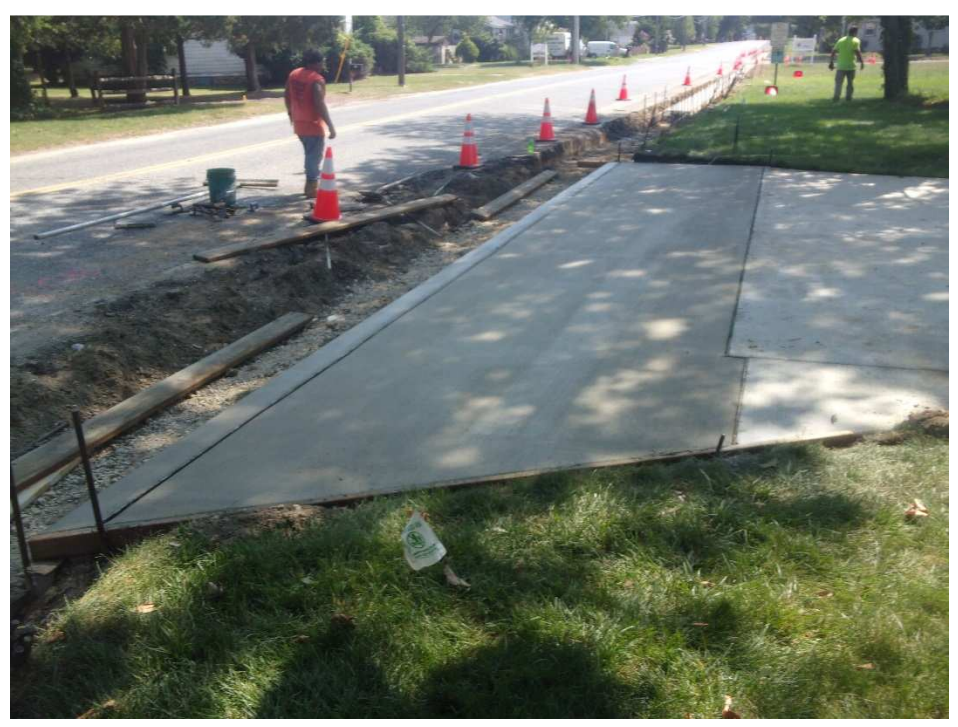
Figure 2 Driveway apron installed 412 Pennington Ave.

consulting engineer services Engineers, Planners, and Land Surveyors