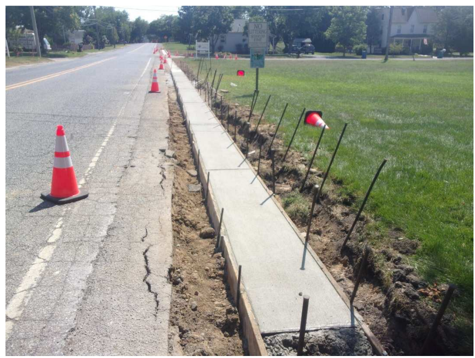
Figure 3 Gutter installed Pennington Ave. right Sta. 19+60 to 20+40