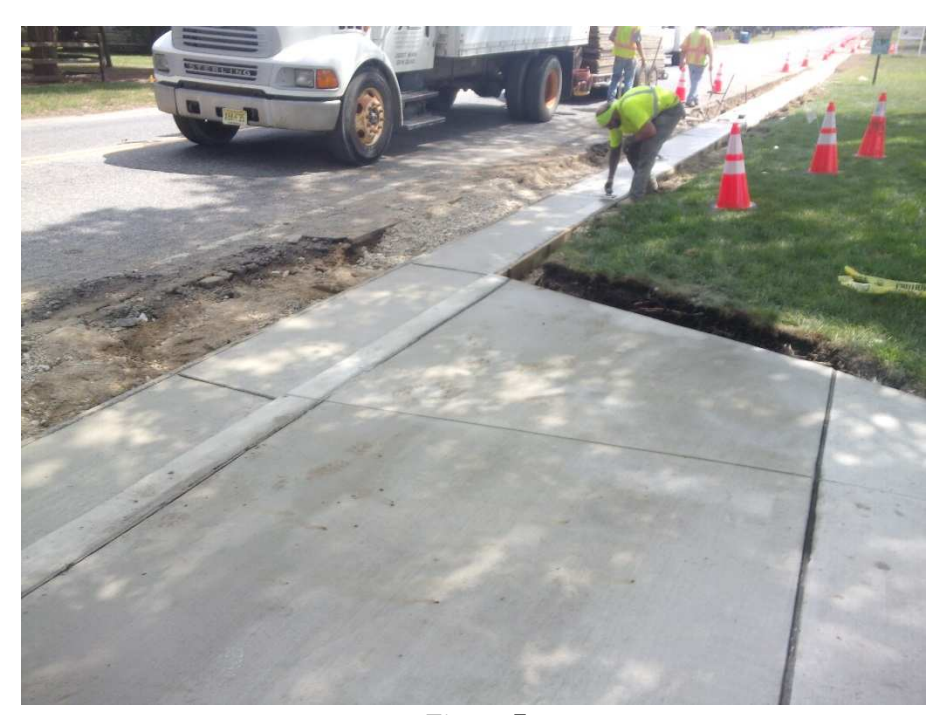
Figure 7 Concrete Gutter installed on Pennington Ave. sta 19+60 to 18+45