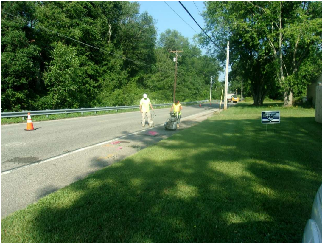
Figure 1 Contractor saw cutting existing roadway for new concrete gutter

Weekly Progress Report # 3 July 6, 2020 to July 10, 2020