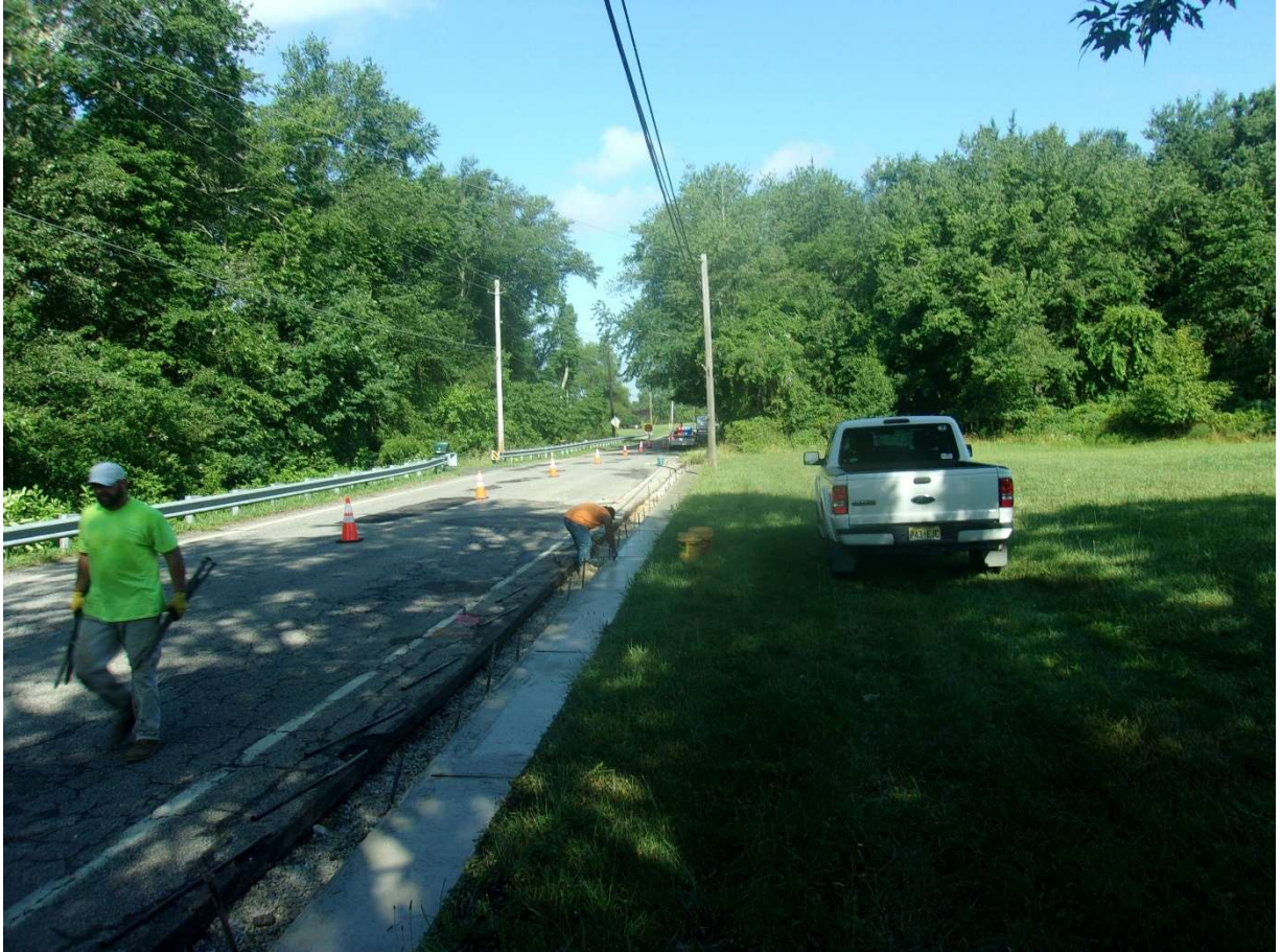
Figure 5 Crew performing finish work to the new concrete gutter.