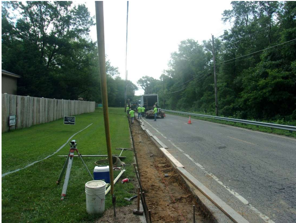
Figure 2 Contractor laying out new concrete gutter and checking finished grades