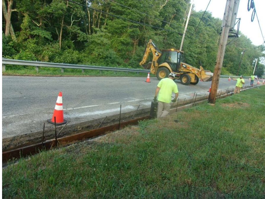
Figure 3 Crew applying release agent to forms prior to pouring new concrete gutter