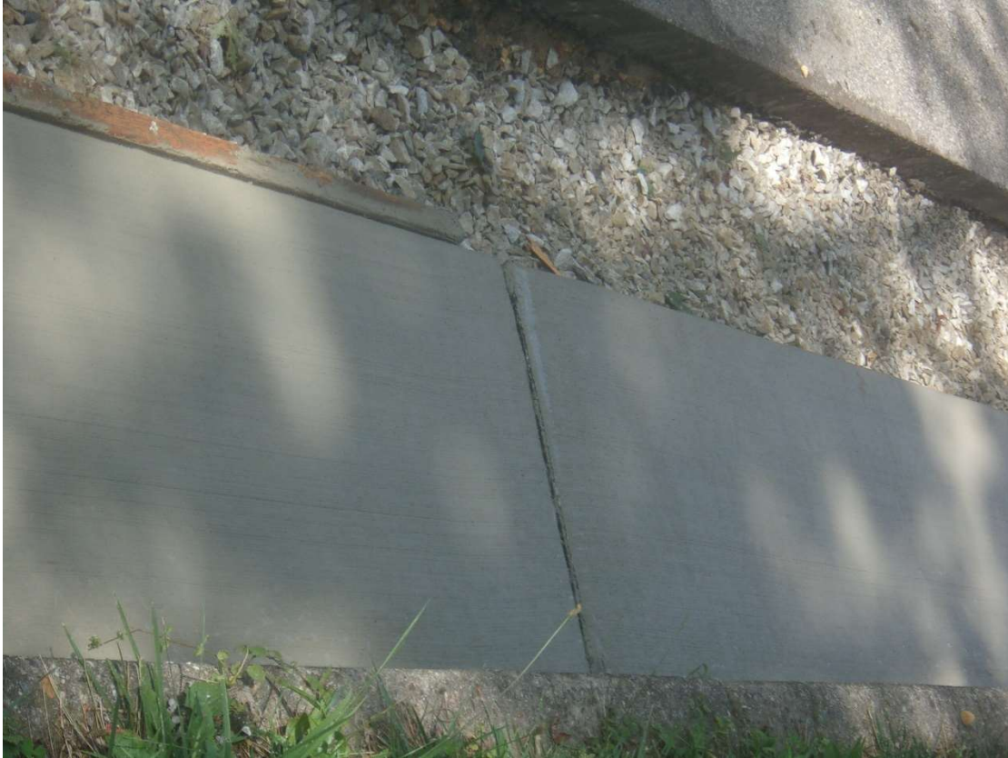
Figure 6 New concrete gutter with brush finish