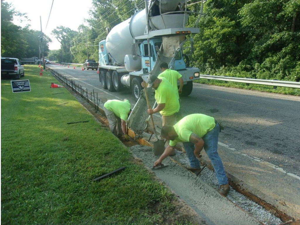
Figure 4 Pouring new concrete gutter along north side of Pennington Avenue