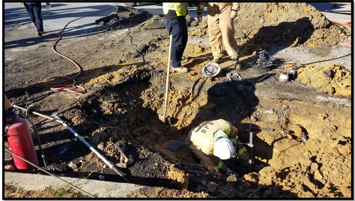
A damaged, unmarked gas main stub near STA 83+00 required repairs by South Jersey Gas representatives.