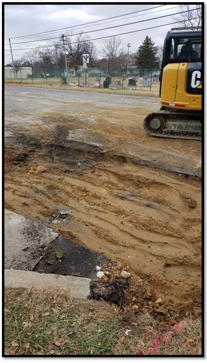
Trench between manholes D-12 and D-13 compacted after installation of 18" RCP.