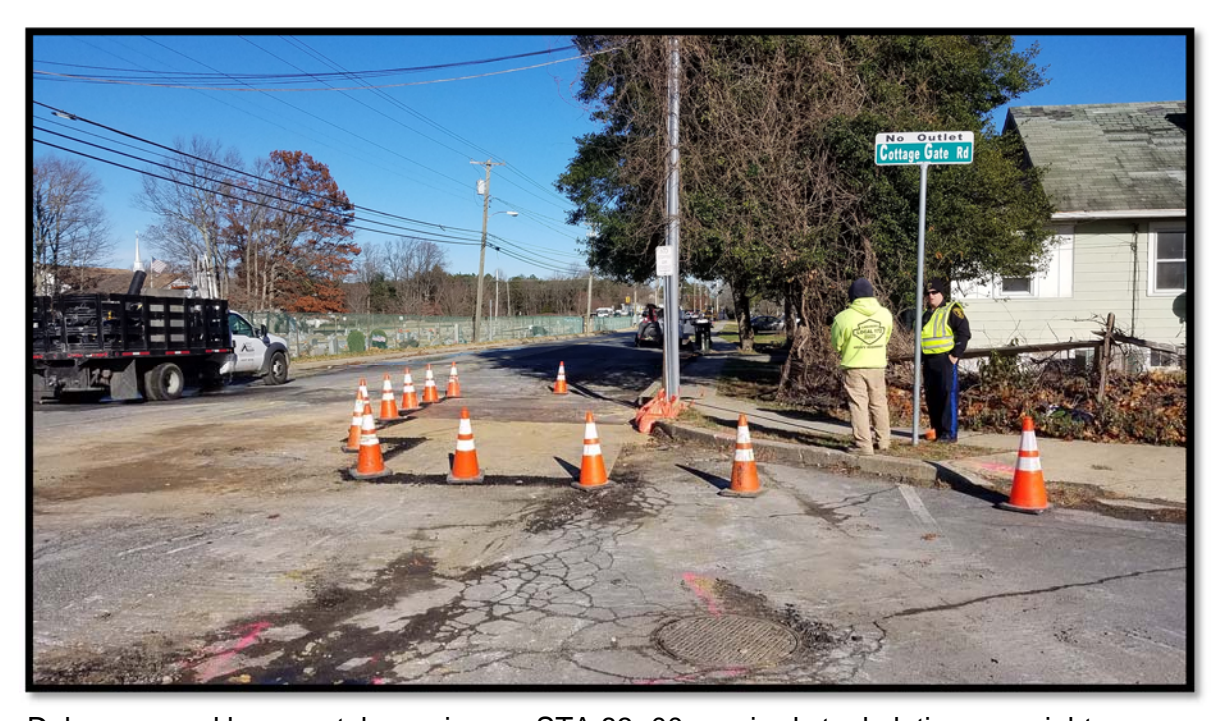
Delays caused by gas stub repair near STA 83+00 required steel plating overnight.