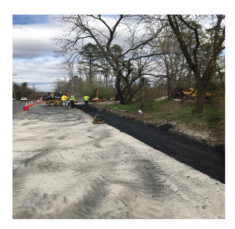
Figure 6-7: Installing DGA and Hot Mix Asphalt Base