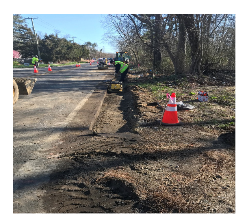
Figure 4-5: Crew cutting out roadway