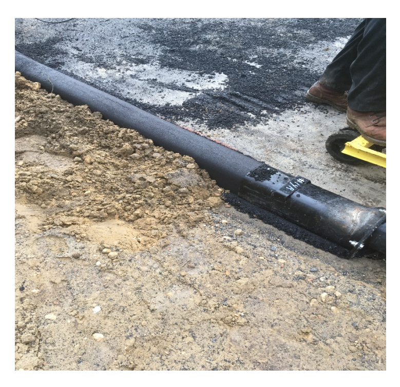
Figure 2-3: Crew installing Asphalt curb