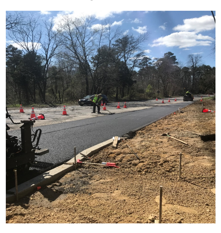
Figure 1: Crew installing Hot Mix Asphalt Base