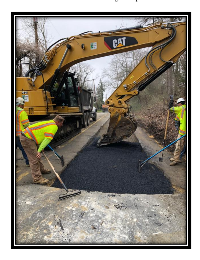
Figure: 3 – Asphalt restoration of the 36" RCP trench along the southbound lane of Watsontown-New Freedom Road (CR 691) in the Borough of Pine Hill