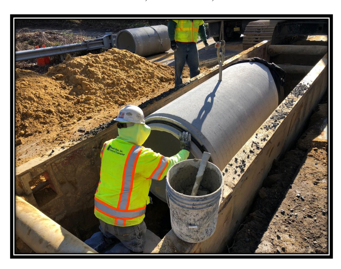
Figure: 1 – Installation of 36" RCP along the southbound lane of Watsontown-New Freedom Road (CR 691) in the Borough of Pine Hill