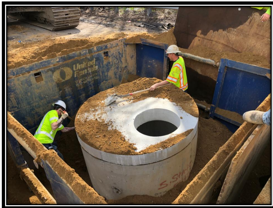
Figure: 2 – Installation of 6' diameter storm sewer manhole on Watsontown-New Freedom Road (CR 691) between Berlin-Clementon Road and Carriage Stop Drive in the Borough of Pine Hill