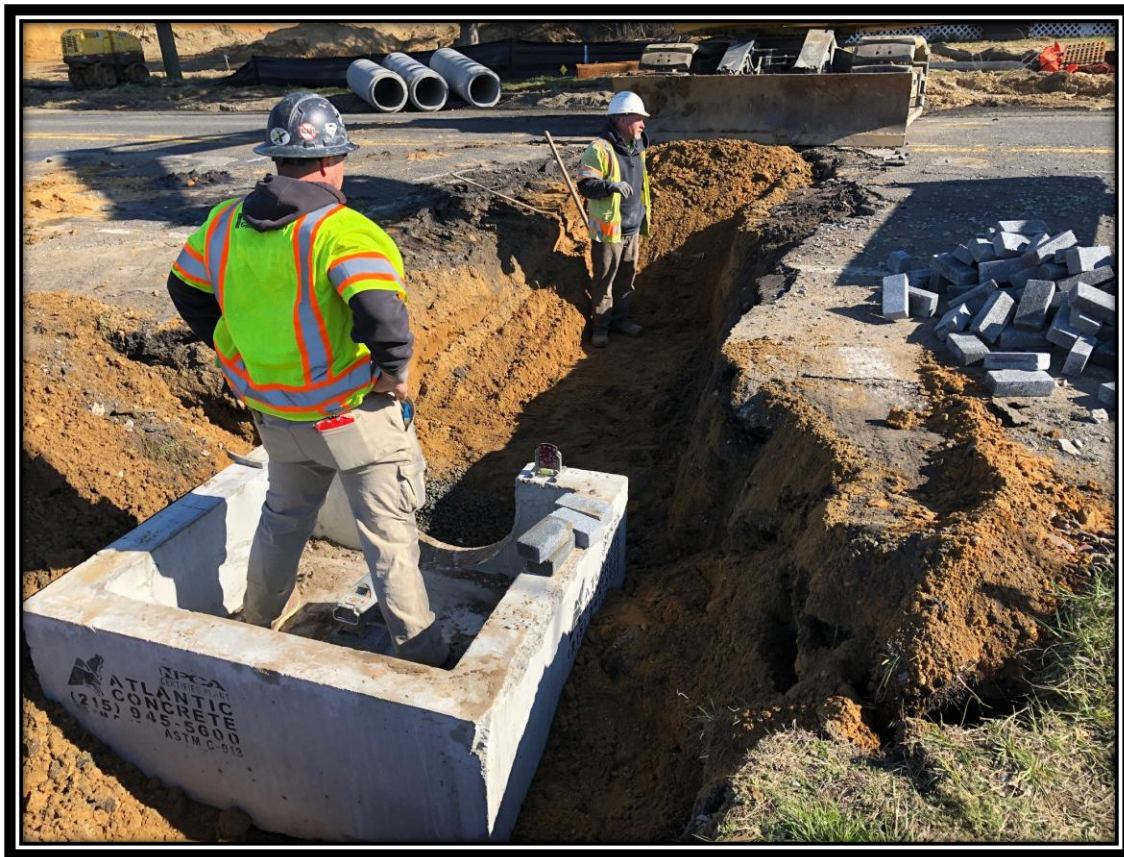
Figure: 1 – Installation of type B inlet along the southbound lane of Watsontown-New Freedom Road (CR 691) in the Borough of Pine Hill