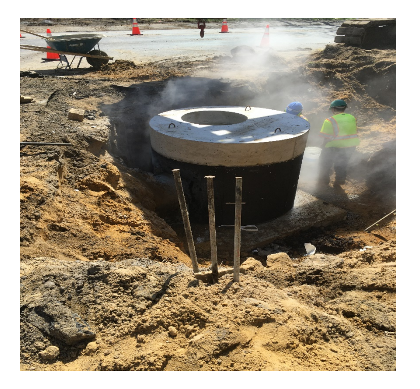
Figure 1: Crew installing Doghouse

Progress Report #1 Friday, March 27, 2020