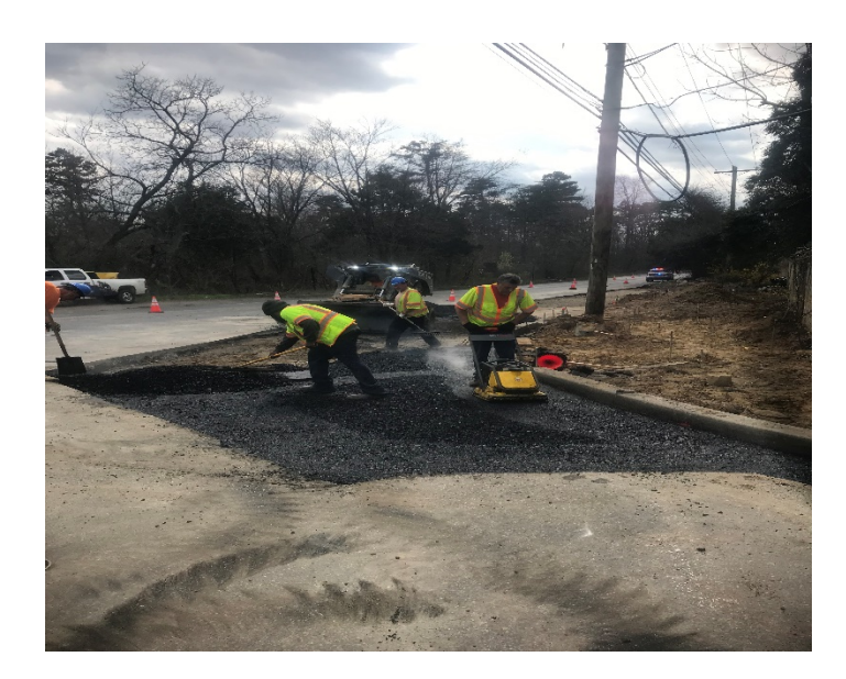
Figure 8-9: Crew installing DGA and Hot Mix Asphalt Base