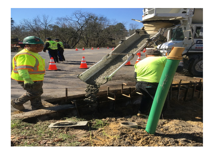
Figure 4-5: Crew installing (9"x18") cement curb