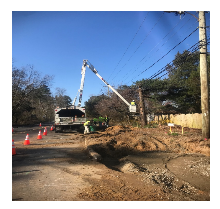
Figure 6-7: Removing existing trees and bushes.