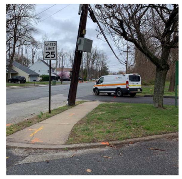
Figure 5: Utility mark out