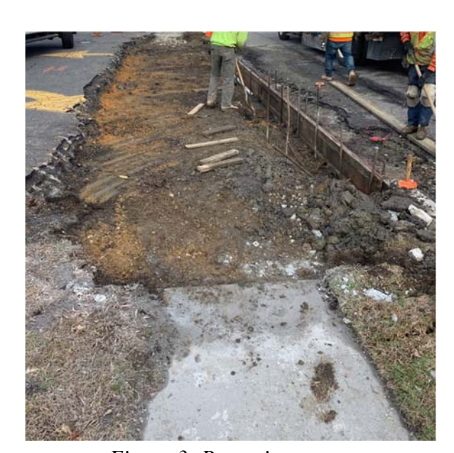
Figure 3: Removing apron