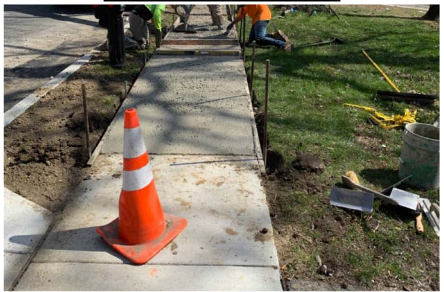
Figure 1: New concrete sidewalk