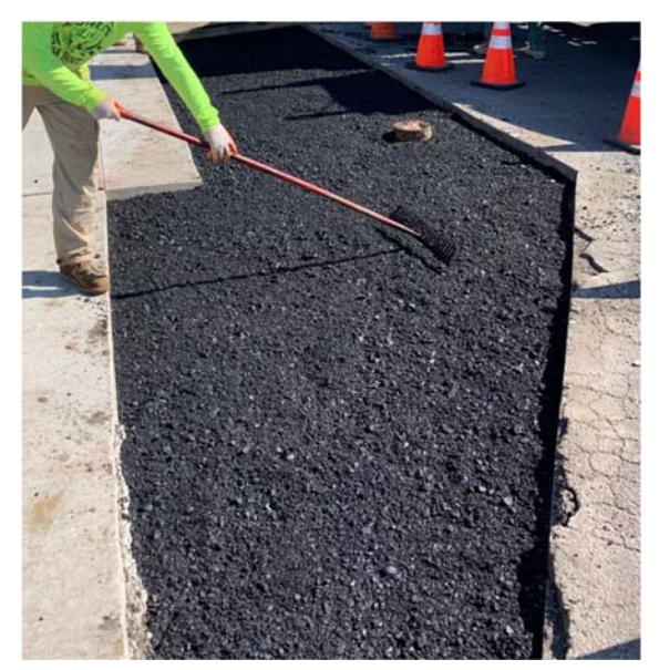
Figure 2: Asphalt repair

Lexa will continue with the removal and replacement of concrete curb, sidewalk, driveways, curb ramps and detectable warning surfaces as specified in the plans along Chapel Avenue. Daily traffic control will continue to be implemented for the duration of the project. A progress meeting via teleconference will be held on April 1, 2020 to review all project related activities.