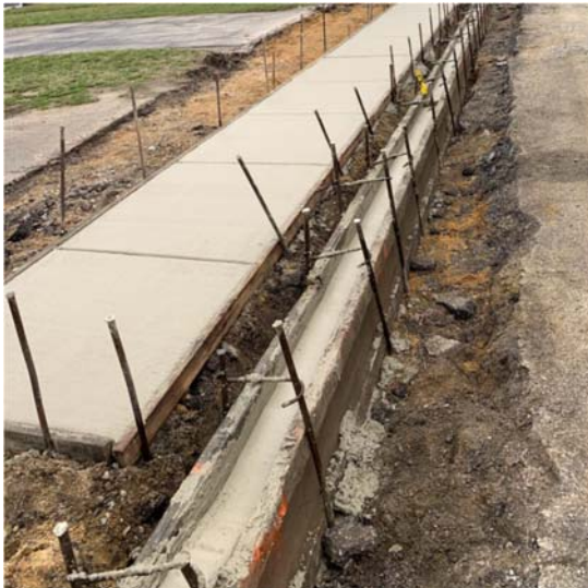
Figure 2: Concrete sidewalk placed

Lexa will continue with the removal and replacement of concrete curb, sidewalk, driveways, and curb ramps as specified in the plans along Chapel Avenue. Daily traffic control will continue to be implemented for the duration of the project. An onsite progress meeting will be held on March 18, 2020 to review all project related activities.