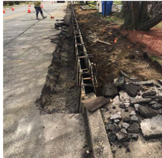
Figure 3: Wooden forms installed for vertical curb pour