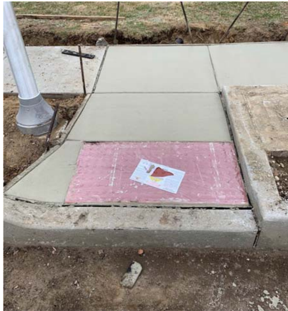
Figure 1: Concrete sidewalk and curb ramp with detectable warning surface placed