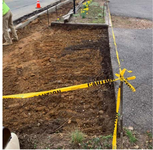
Figure 5: Removal of concrete aprons