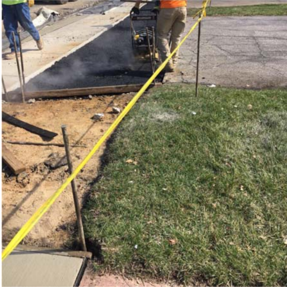
Figure 4: Tamping asphalt driveway