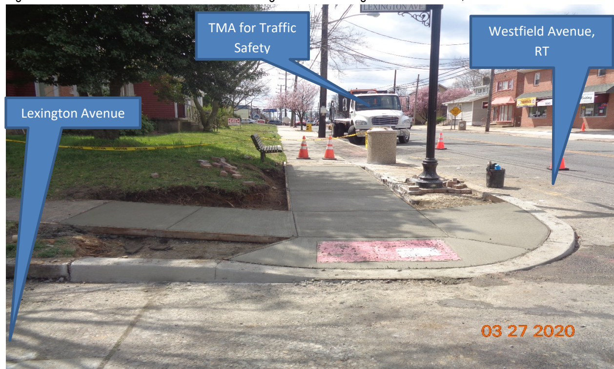
Figure 4: West concrete curb and sidewalk at Lexington Avenue along Westfield Avenue, RT