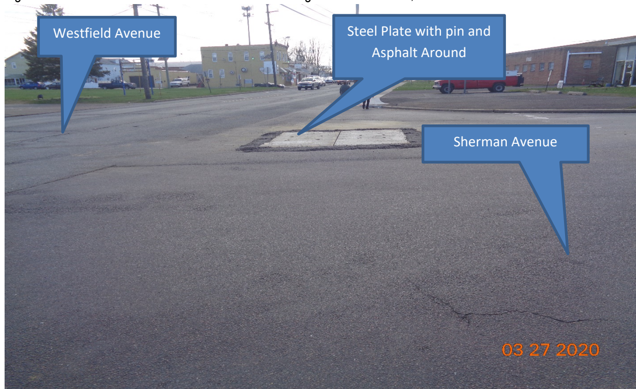
Figure 6: PSE&G Gas leak fix at Sherman Avenue along Westfield Avenue,