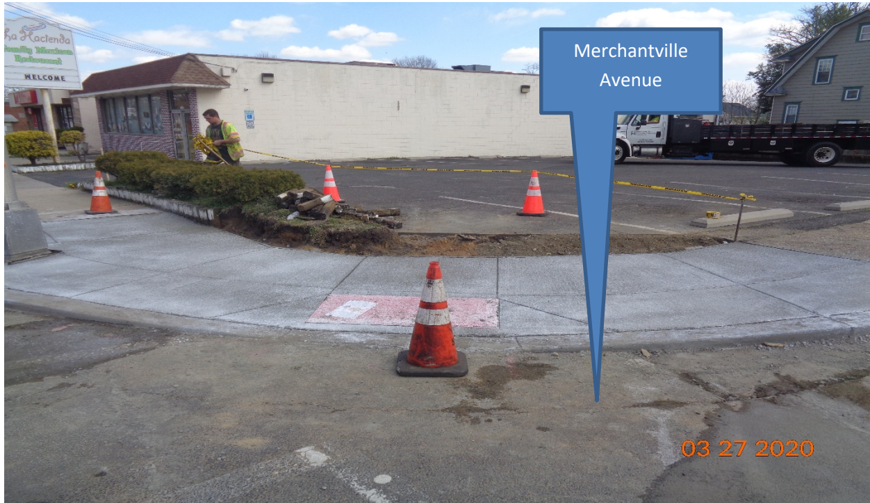
Figure 1: East concrete curb and sidewalk at Merchantville Avenue along Westfield Avenue, RT