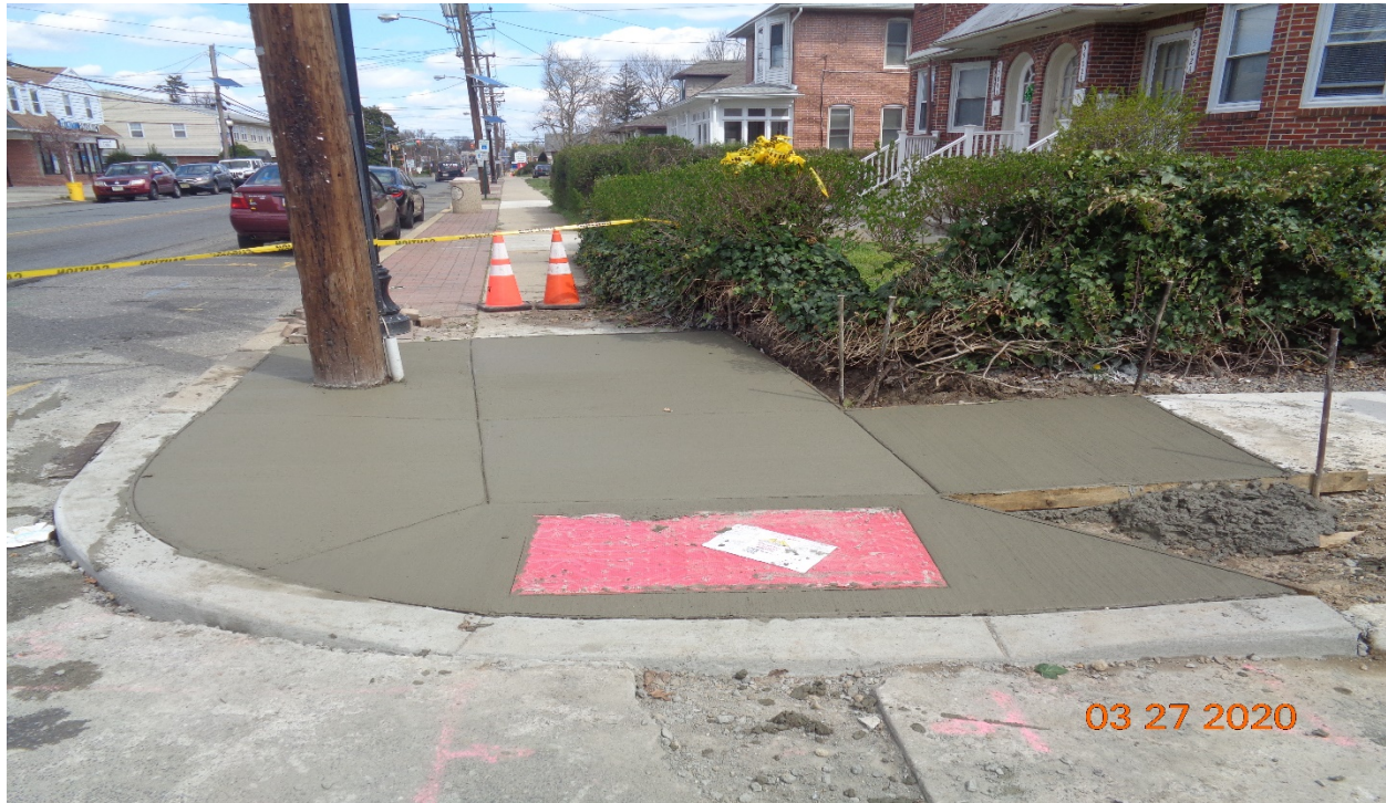
Figure 3: East concrete curb and sidewalk at Lexington Avenue along Westfield Avenue, RT