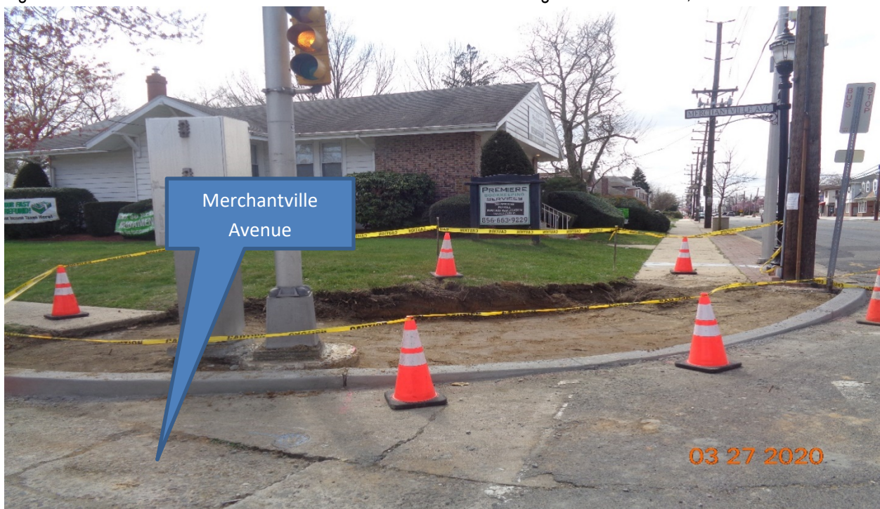
Figure 2: West concrete curb at Merchantville Avenue along Westfield Avenue, RT