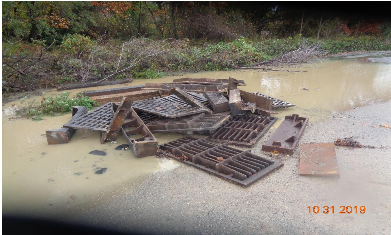
Figure 9: Existing castings and curb pieces were stockpiled at laydown yard.

Prepared By: Gunvant Mistry Resident Engineer