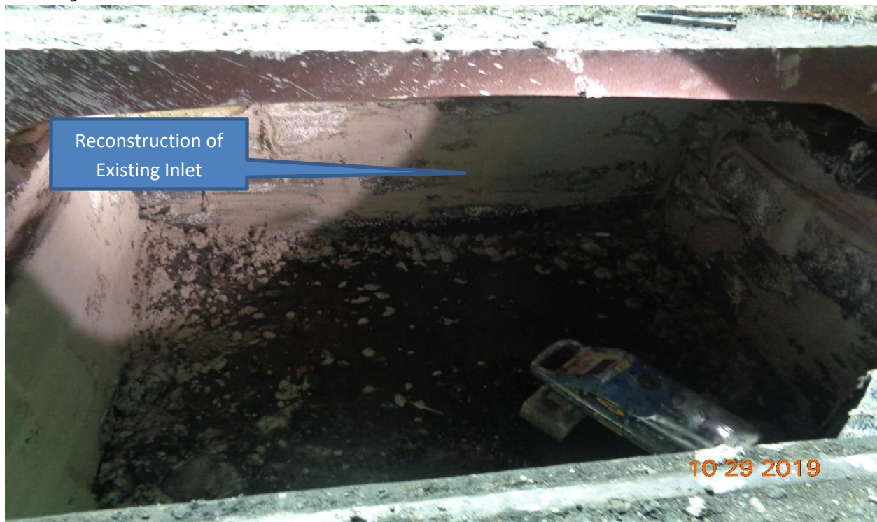
Figure 4: Installation of 12" ductile iron pipe across Derosse Avenue from existing inlet to existing manhole- Inlet reconstruction.