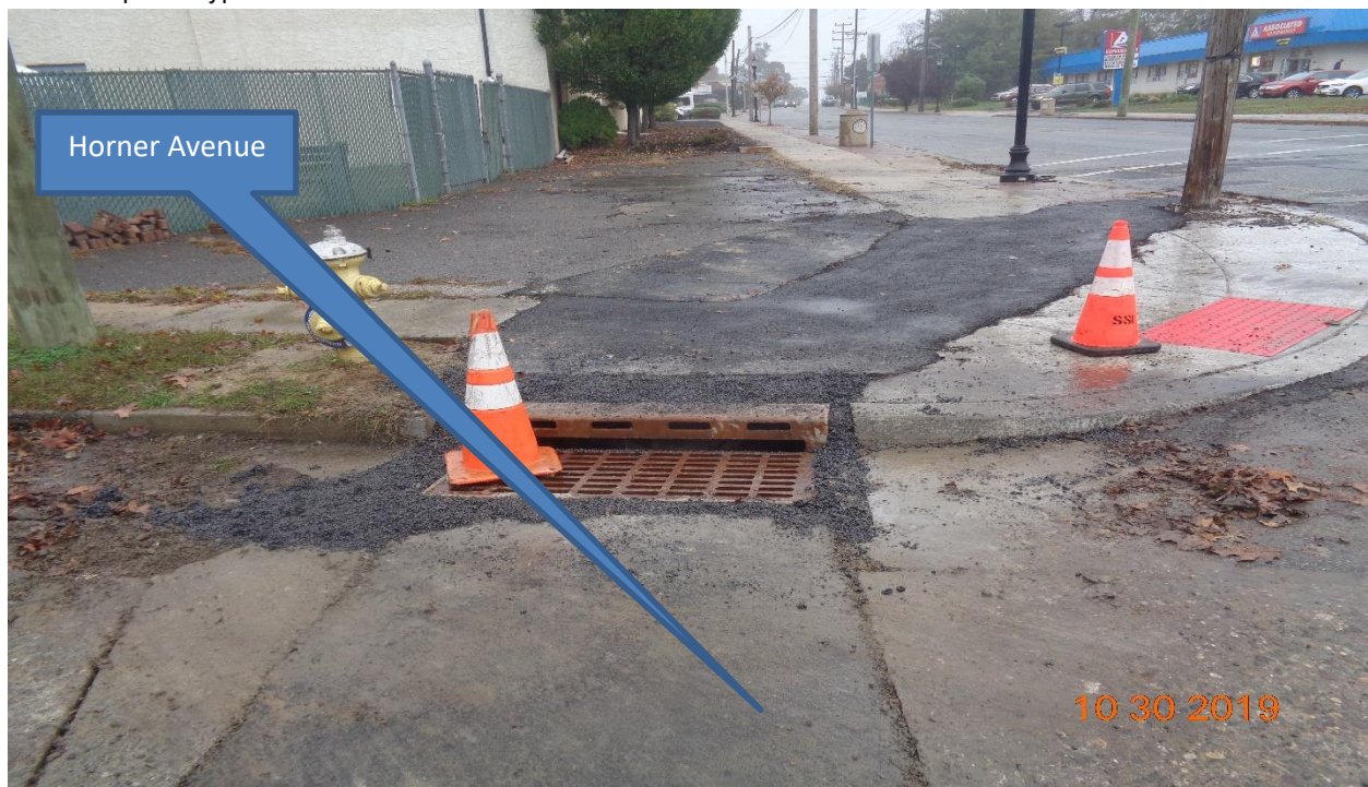
Figure 8: Existing three (3) Type B inlets along Horner Avenue East and West were Reconstructed using new casting, And Curb piece, Type N ECO was installed.