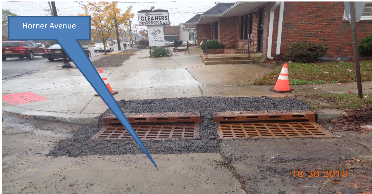
Figure 7: Existing three (3) Type B inlets along Horner Avenue East and West were Reconstructed using new casting, And Curb piece, Type N ECO was installed.