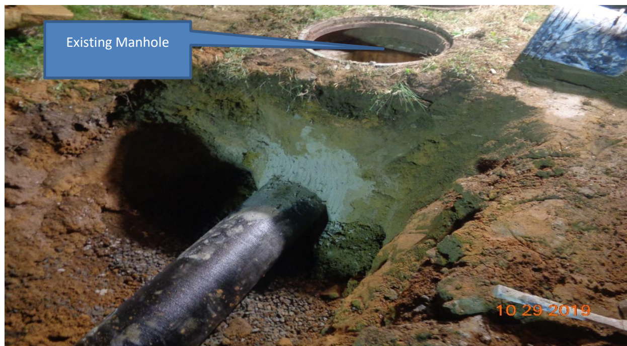
Figure 5: Installation of 12" ductile iron pipe across Derosse Avenue from existing inlet to existing manhole.