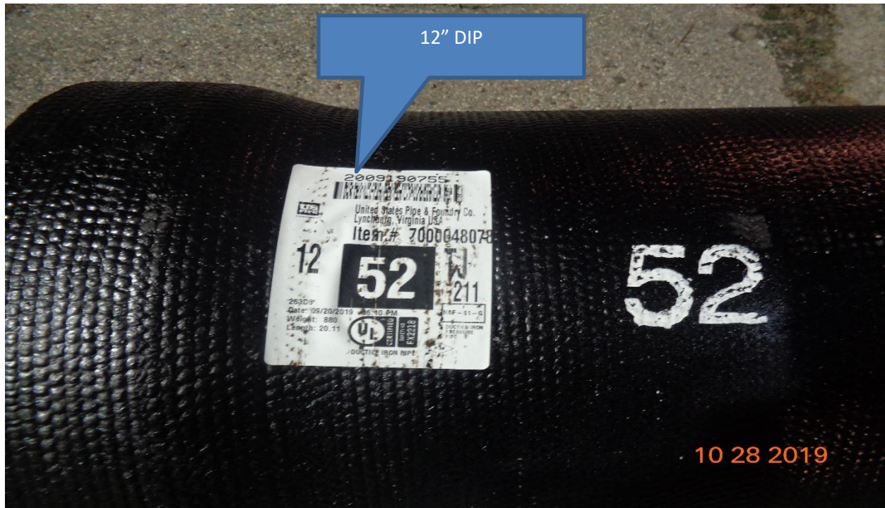
Figure 1: Installation of 12\" ductile iron pipe across Derausse Avenue form existing inlet to existing manhole.