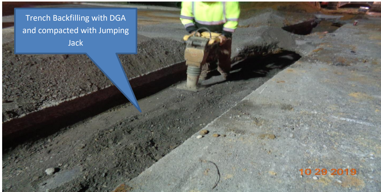
Figure 3: Installation of 12" ductile iron pipe across Derosse Avenue from existing inlet to existing manhole – Trench Backfilling.