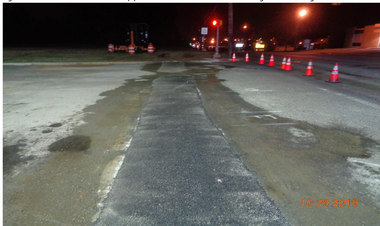
Figure 6: Installation of 12" ductile iron pipe across Derosse Avenue from existing inlet to existing manhole – Asphalt placed for Trench.