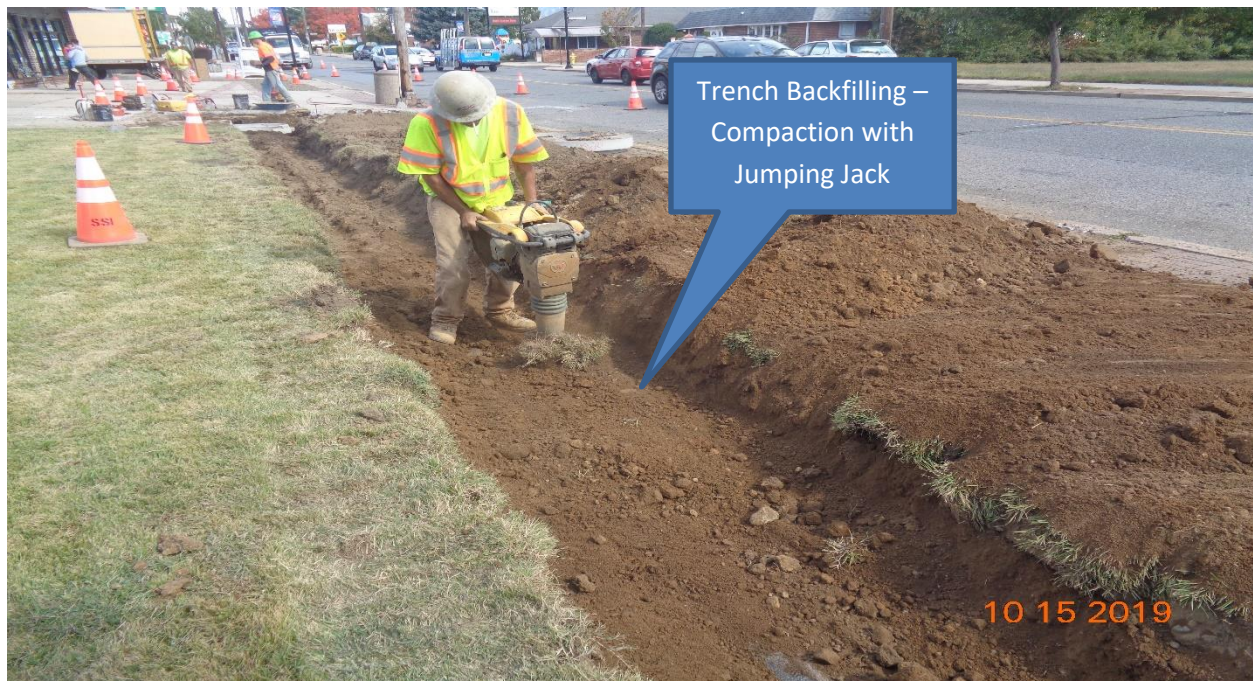
Figure 5: Installation of 16" DIP Along Westfield Avenue from Proposed Manhole to Proposed Manhole at Hollinshead Avenue.