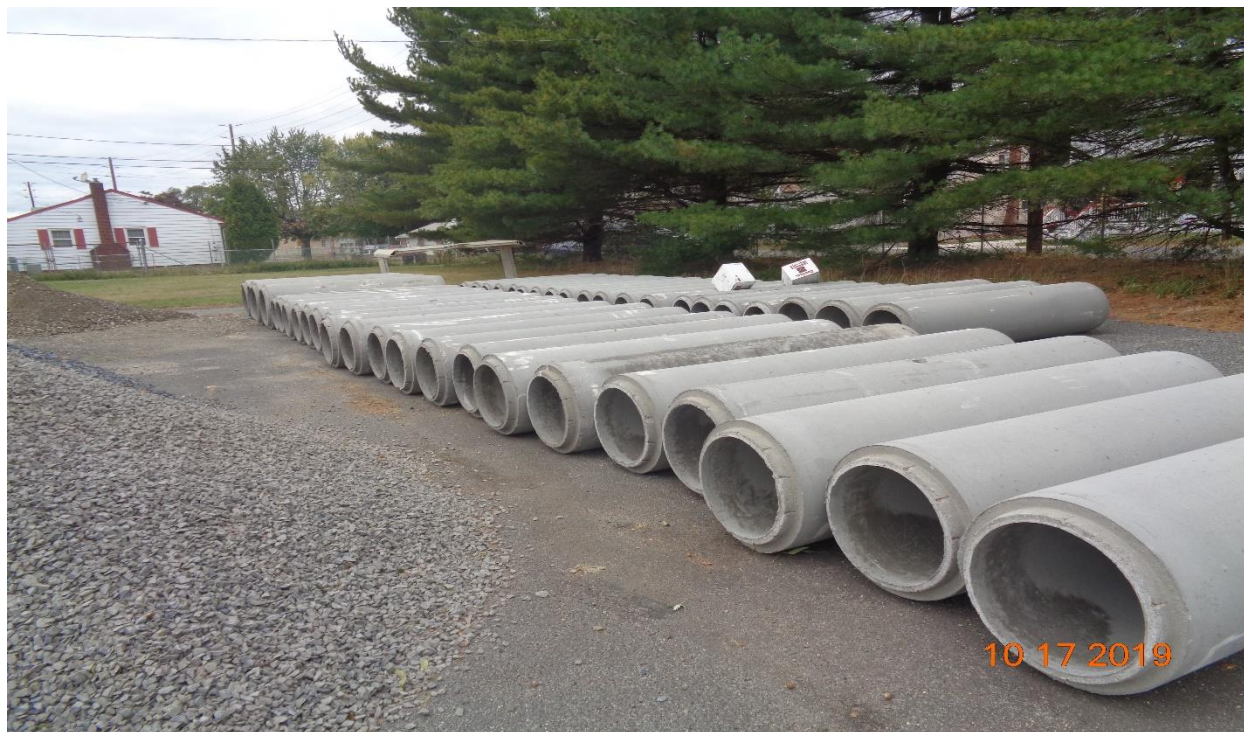
Figure 11: Reinforced Concrete Pipes were delivered at Site.