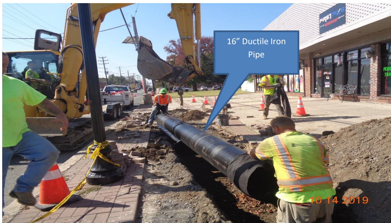
Figure 1: Installation of 16" Ductile Iron Pipe from Inlet on Hillcrest Avenue to Inlet along Westfield Avenue, LT