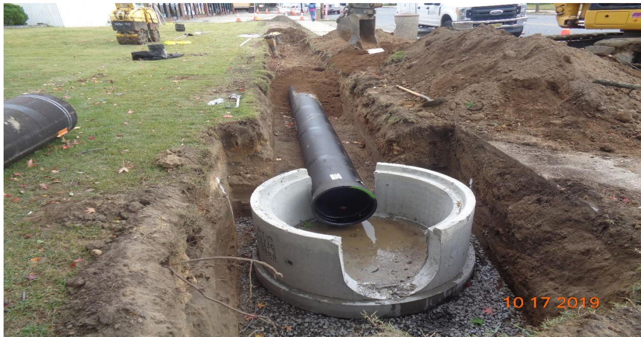
Figure 6: Installation of 16" DIP to Proposed Manhole at Holinshed Avenue