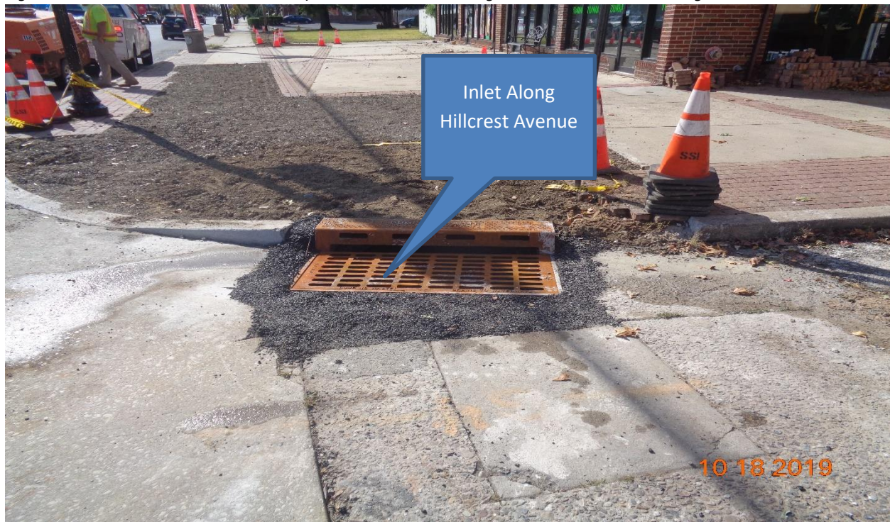
Figure 10: Inlet along Hillcrest Avenue – Reconstructed Inlet Type B using new casting and set curb piece Type N ECO