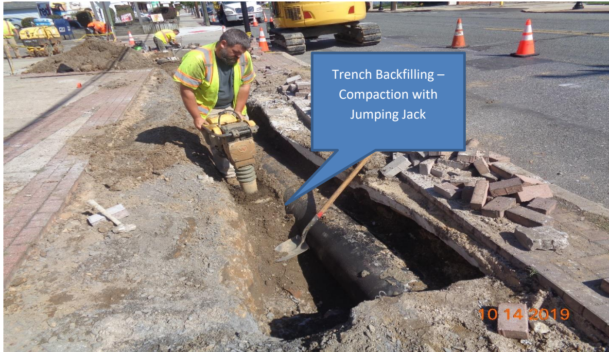
Figure 3: Installation of 16" Ductile Iron Pipe from Inlet on Hillcrest Avenue to Inlet along Westfield Avenue, LT