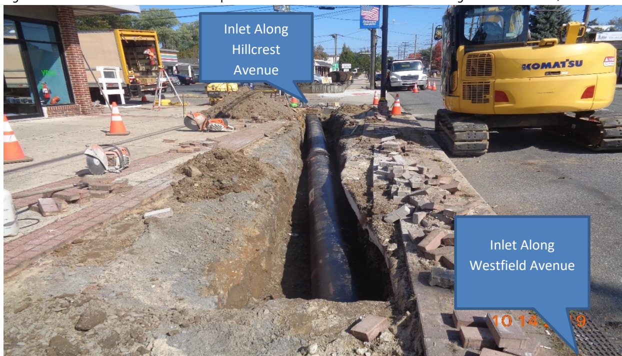
Figure 2: Installation of 16" Ductile Iron Pipe from Inlet on Hillcrest Avenue to Inlet along Westfield Avenue, LT