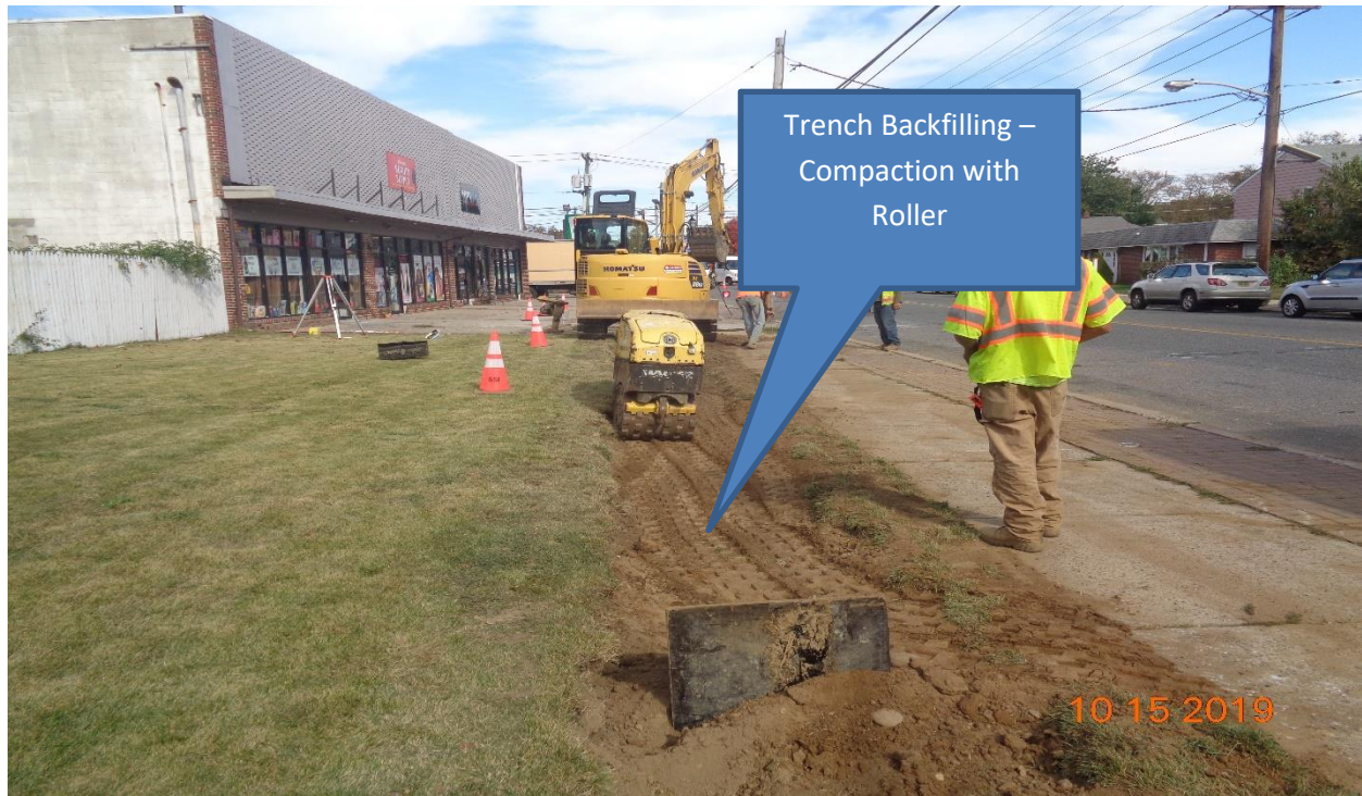
Figure 5: Installation of 16" DIP Along Westfield Avenue from Proposed Manhole to Proposed Manhole at Hollinshead Avenue.