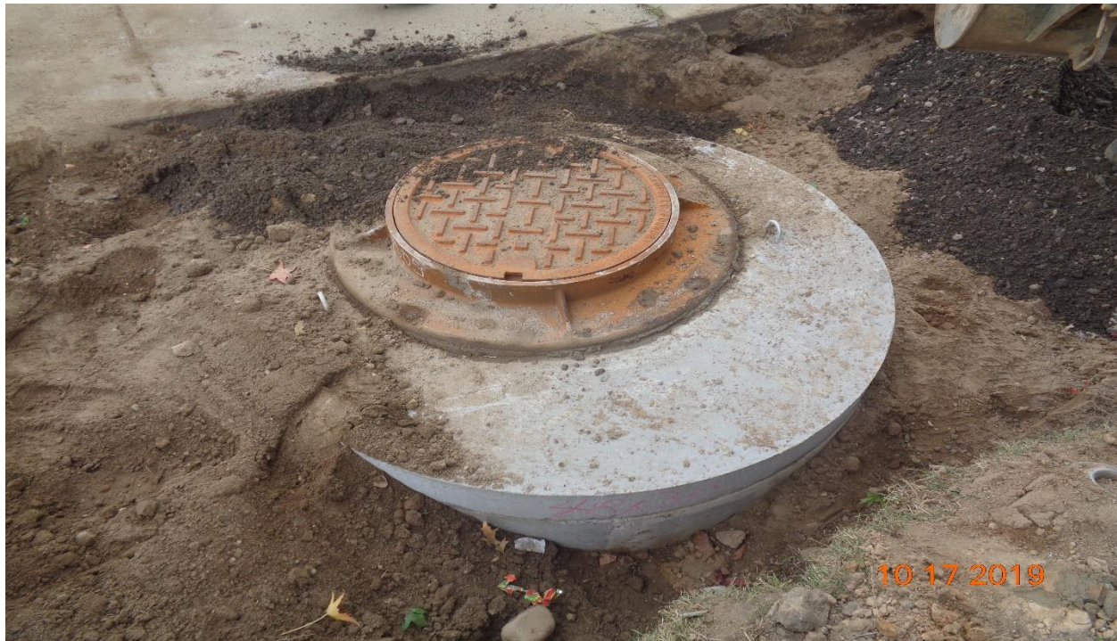
Figure 8: Manhole Cover frame was installed with Manhole Cover