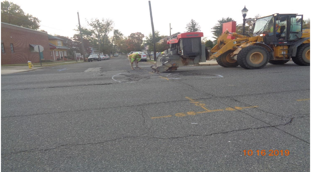
Figure 13: Grinding Humps along Westfield Avenue