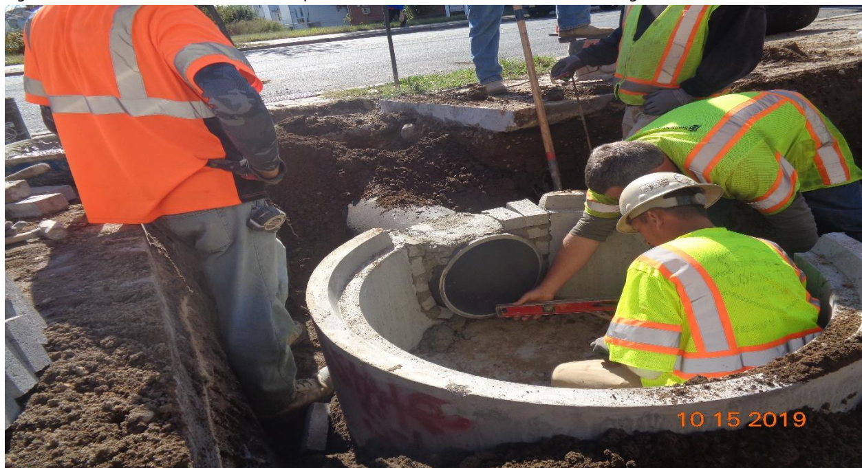
Figure 4: Installation of 16" DIP from Inlet along Westfield Avenue to Proposed 4' Diameter Manhole