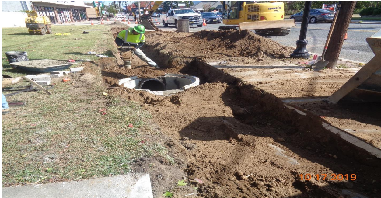
Figure 7: Installation of 16" DIP from Proposed Manhole at Hollingshead Avenue to Inlet Along Hollinshead Avenue