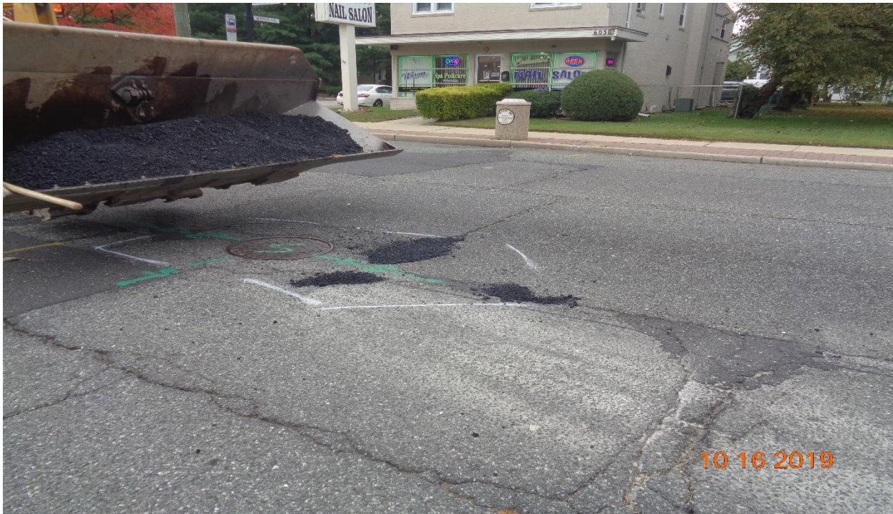
Figure 14: Repairing Potholes along Westfield Avenue