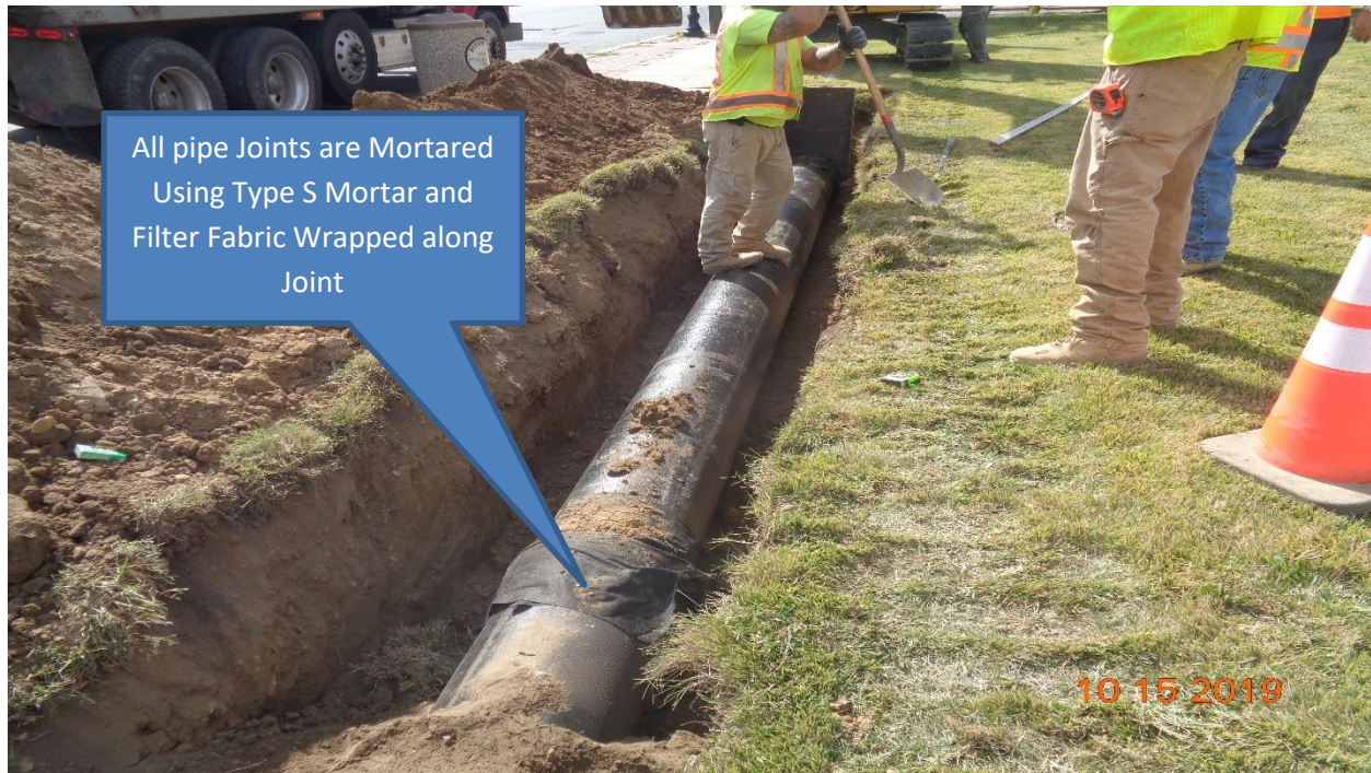
Figure 5: Installation of 16" DIP Along Westfield Avenue from Proposed Manhole to Proposed Manhole at Hollinshead Avenue.