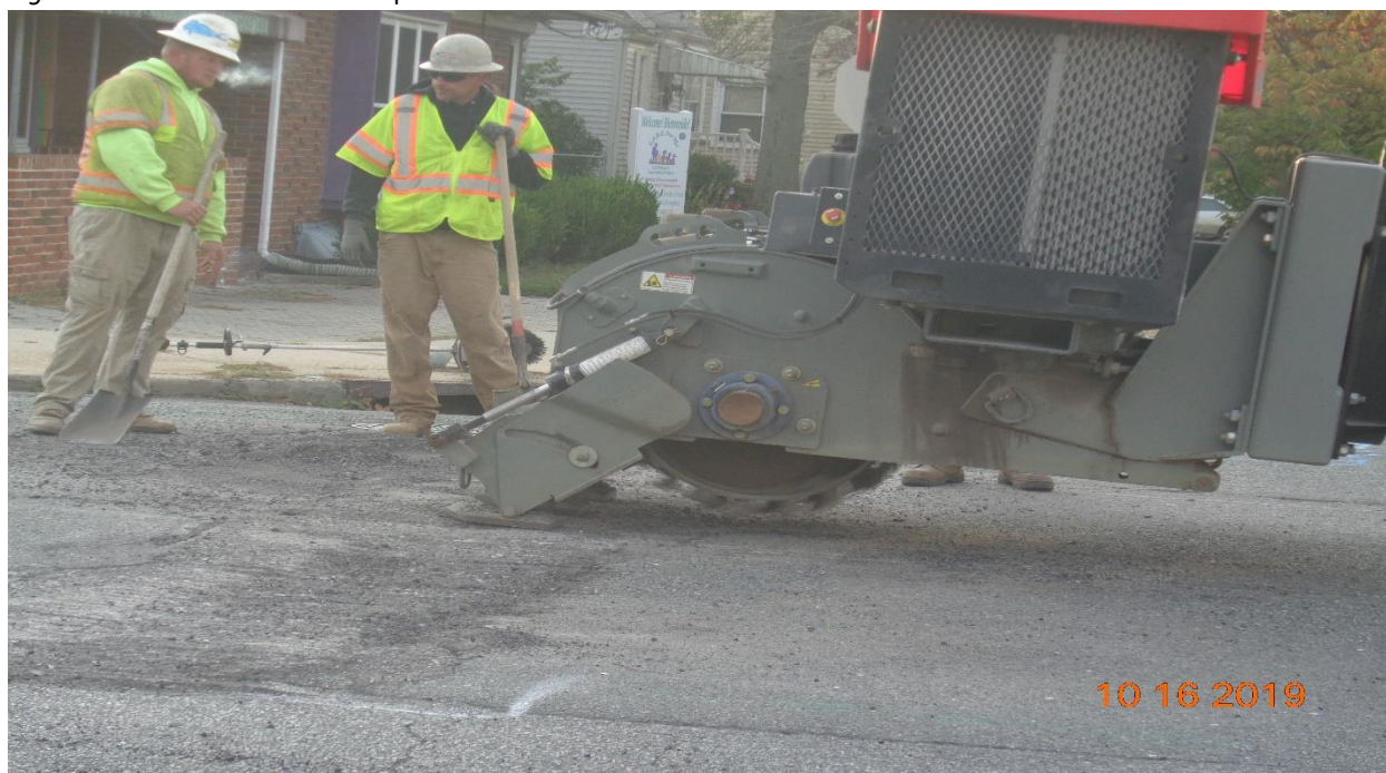
Figure 12: Grinding Humps along Westfield Avenue