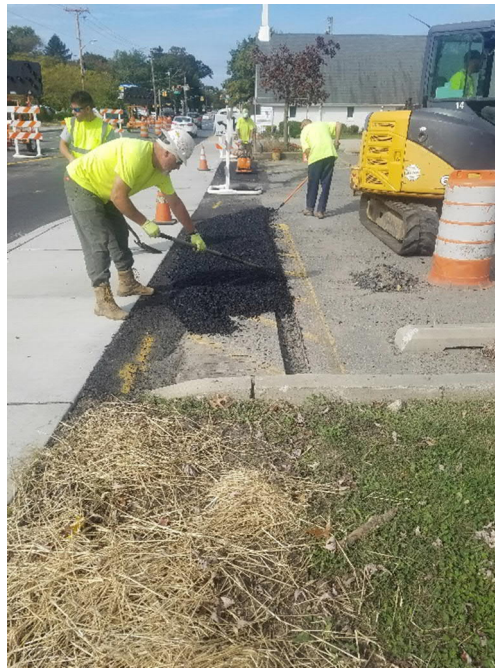
Repairs to the senior centers parking area

Borough of Clementon County of Camden, NJ Weekly Progress Report #51 October 7 to October 11, 2019