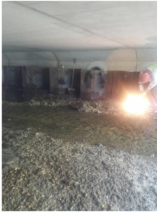
Cutting sheets under bridge