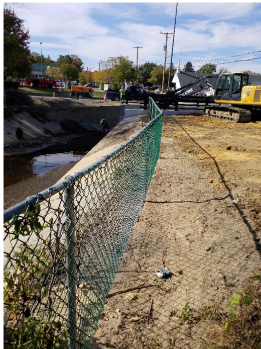
Fence installed on bank side