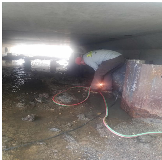
Still cutting sheets under bridge!