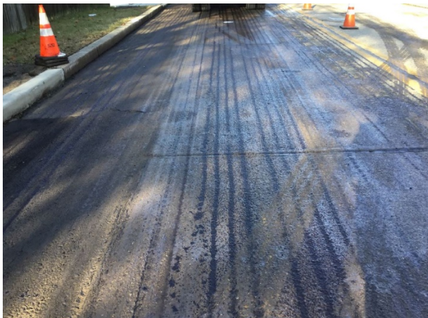
Figure 2: Milled roadway cleaned and tack applied

Marandino will conduct roadway striping and sign installation along Hopkins Avenue as well as punchlist work. Daily traffic control will continue to be implemented for the duration of the project.