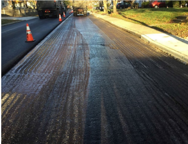
Figure 4: Paving operations