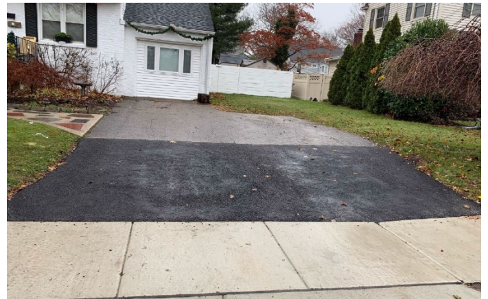
Figure 3: Paved driveway