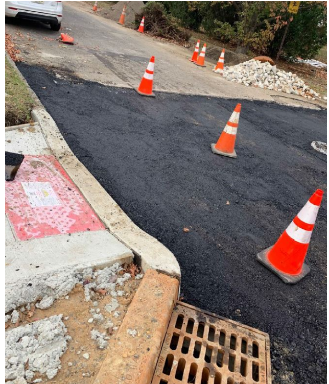
Figure 5: Reconstructed roadway section