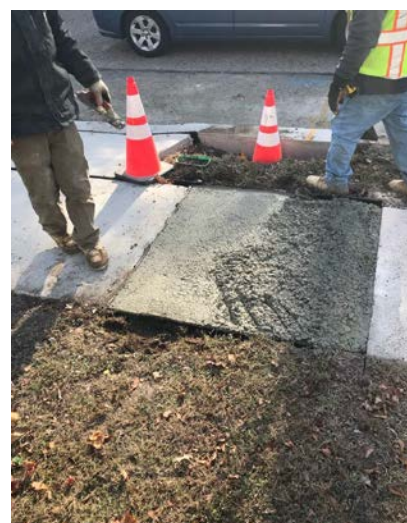
Figure 3: Concrete sidewalk placement