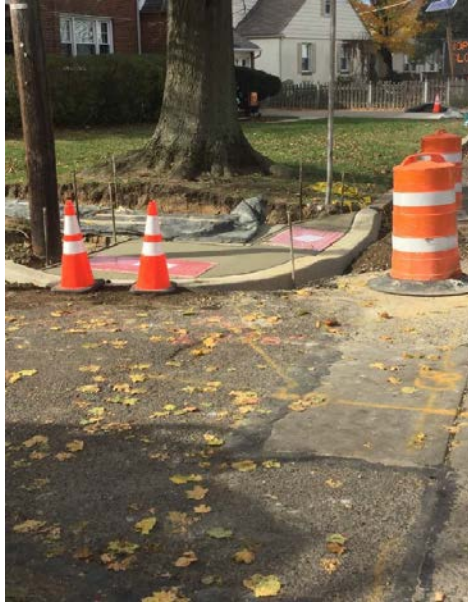
Figure 1: Concrete curb ramps