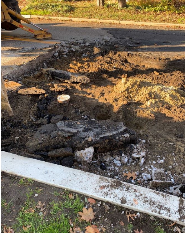
Figure 4: Roadway demolition