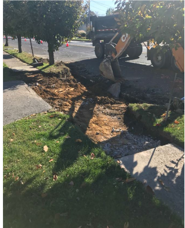
Figure 5: Excavation operations