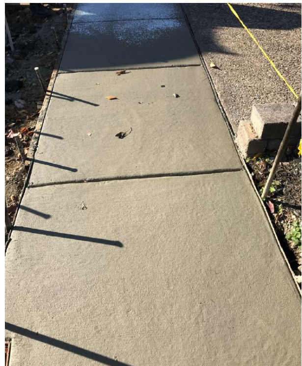
Figure 3: Concrete sidewalk