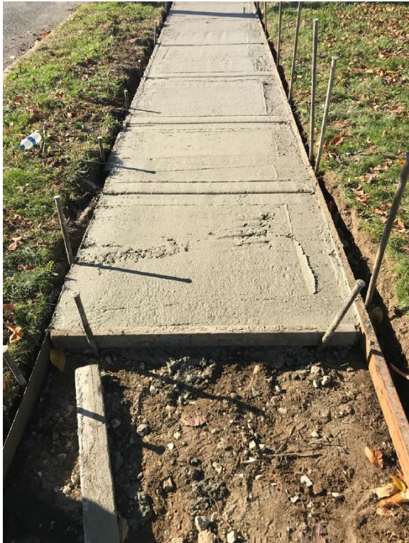
Figure 4: Concrete sidewalk placed