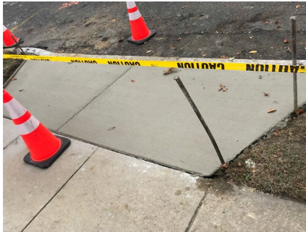
Figure 2: Concrete driveway

Lexa will continue with the removal and replacement of concrete curb, sidewalk, driveways, and curb ramps as specified in the plans along Chapel Avenue. Daily traffic control will continue to be implemented for the duration of the project. An onsite progress meeting will be held on November 12, 2019 to review all project related activities.