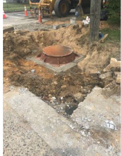
Figure 3: Inlet converted to a manhole