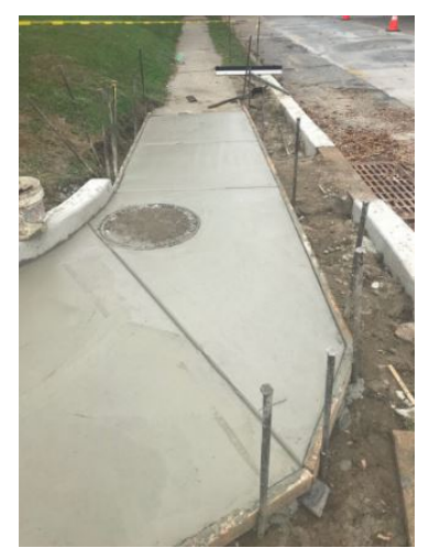
Figure 2: Concrete sidewalk placed