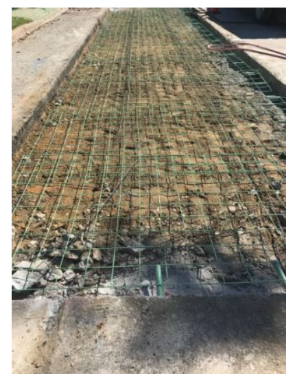
Figure 4: Reinforcement for concrete roadway repairs