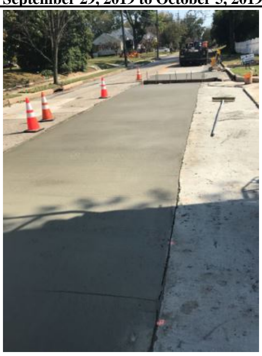
Figure 1: Concrete roadway repair