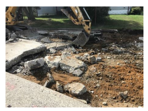
Figure 2: Roadway excavation