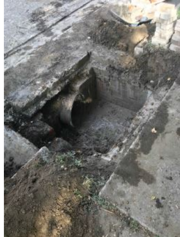
Figure 3: Storm sewer inlet reconstruction