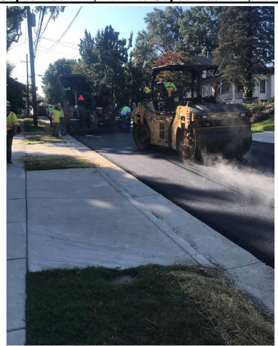
Figure 1: Paving operations by Paul VI

September 15, 2019 to September 21, 2019