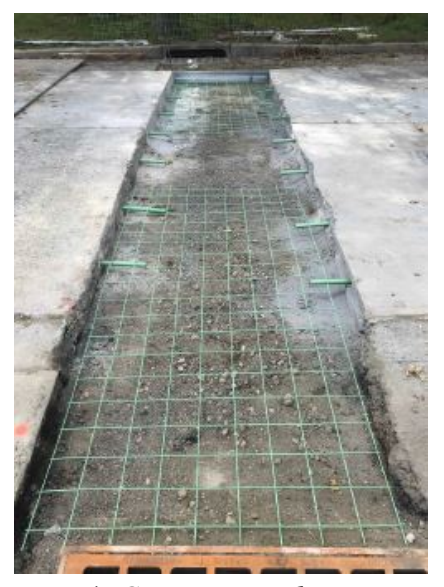
Figure 4: Concrete roadway repairs