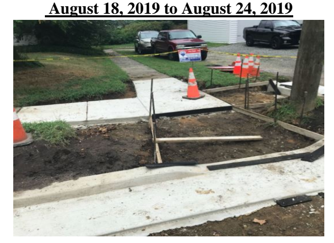
Figure 1: Concrete curb ramp reconstruction