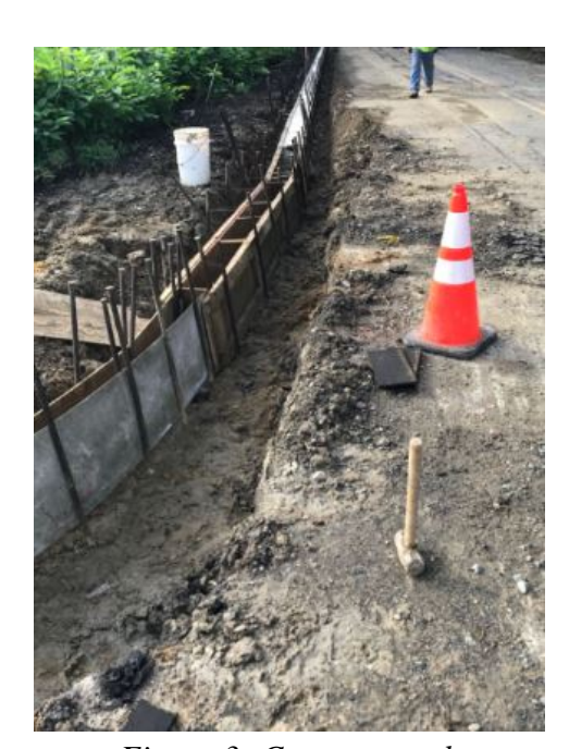
Figure 3: Concrete curb