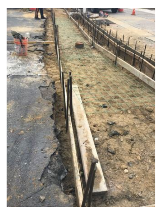
Figure 2: Bruno's Pizza work area

Marandino will continue with the removal and replacement of concrete curb, sidewalk, driveways, and curb ramps as specified in the plans along Hopkins Avenue. Roadway repairs will be conducted between Cuthbert Boulevard and the culvert. Daily traffic control will continue to be implemented for the duration of the project.