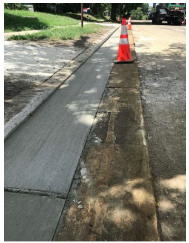
Figure 4: Concrete gutter work