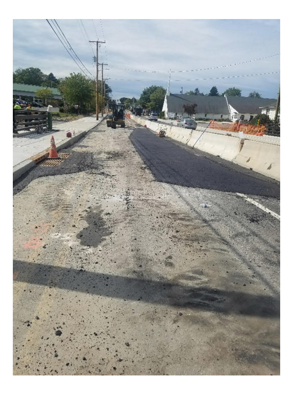
Leveling course of asphalt installed where needed