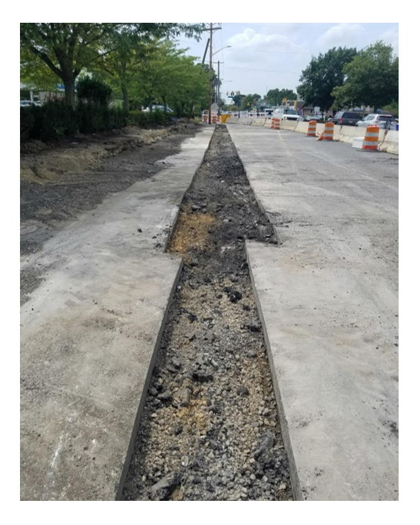
Asphalt and concrete removed