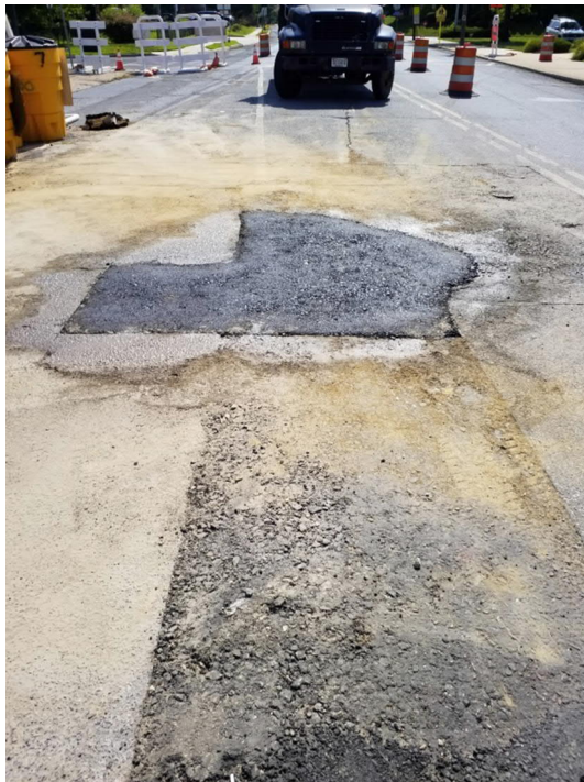
Finally, asphalt patch