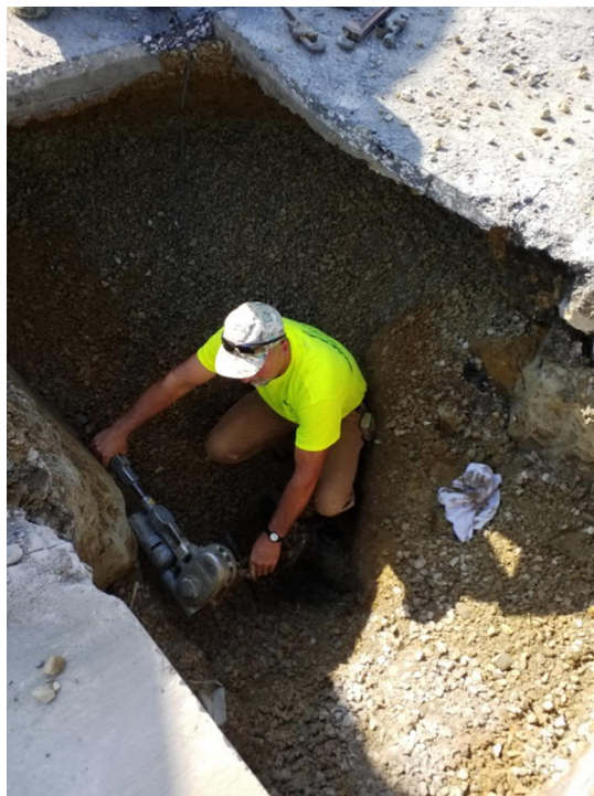
Attaching service line to new main.