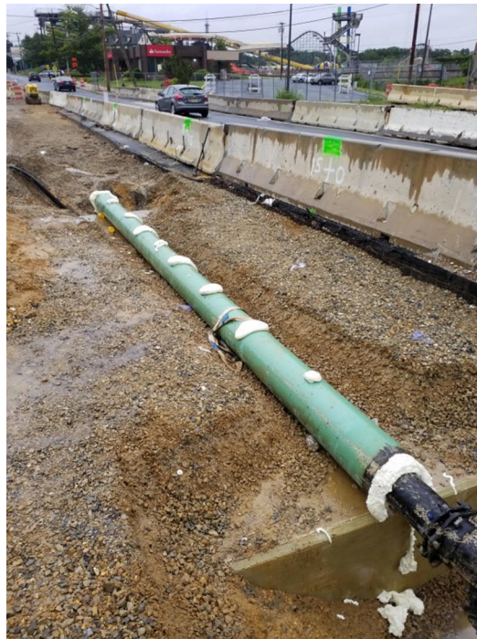
New 6" Water main inside steel casing across culvert.

Borough of Clementon County of Camden, NJ Weekly Progress Report #40 July 22 to July 26, 2019