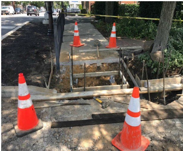
Figure 2: Concrete curb ramp formed

Marandino will allow time for the stamped synthetic pavement to cure, and then remove the traffic control around the concrete curb ramps and stripe the roadway.