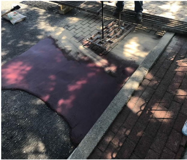
Figure 4: Stamped synthetic pavement installation