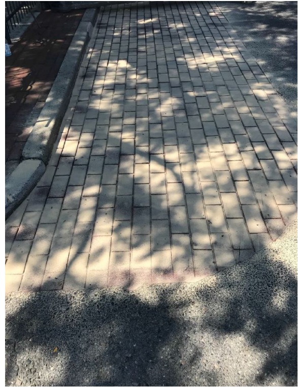
Figure 5: Stamped synthetic pavement installation