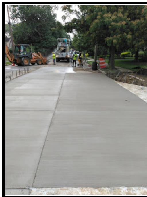
Figure 3: New SB roadway on Crystal Lake Avenue at Avondale.