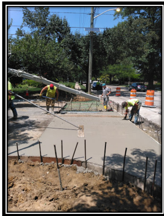
Figure 1: New concrete roadway on Avondale Avenue at Crystal Lake.

Monday, July 15, 2019 to Friday, July 19, 2019