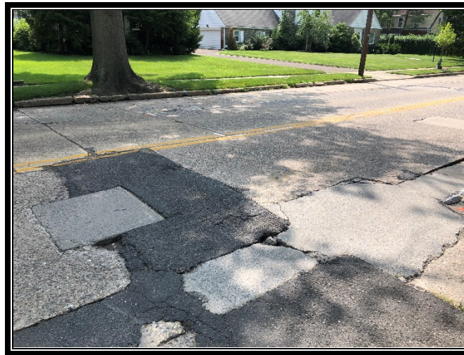
Figure 2: Existing SB roadway on Crystal Lake Avenue at Avondale.