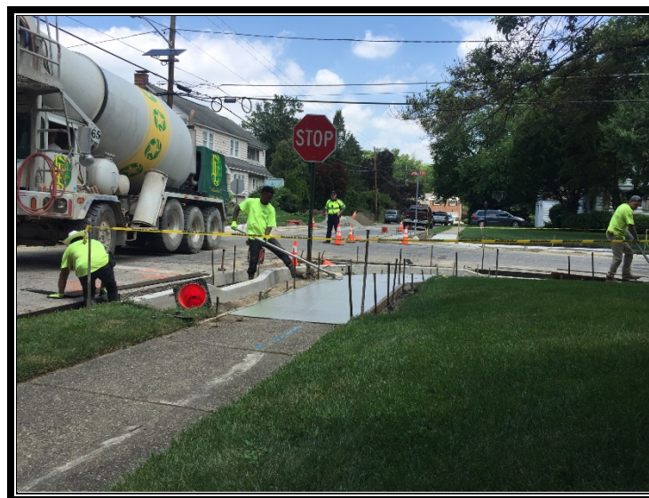
Figure 3: New sidewalk at Avondale & Foreman Avenues.