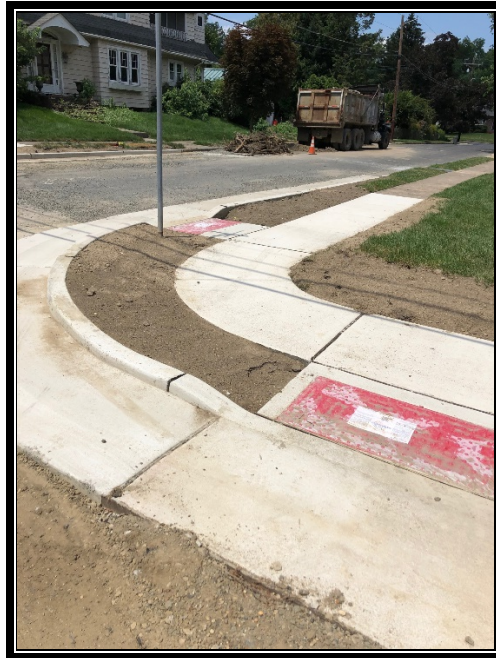
Figure 2: New concrete sidewalk and handicap ramps at Avondale & Foreman Avenues.