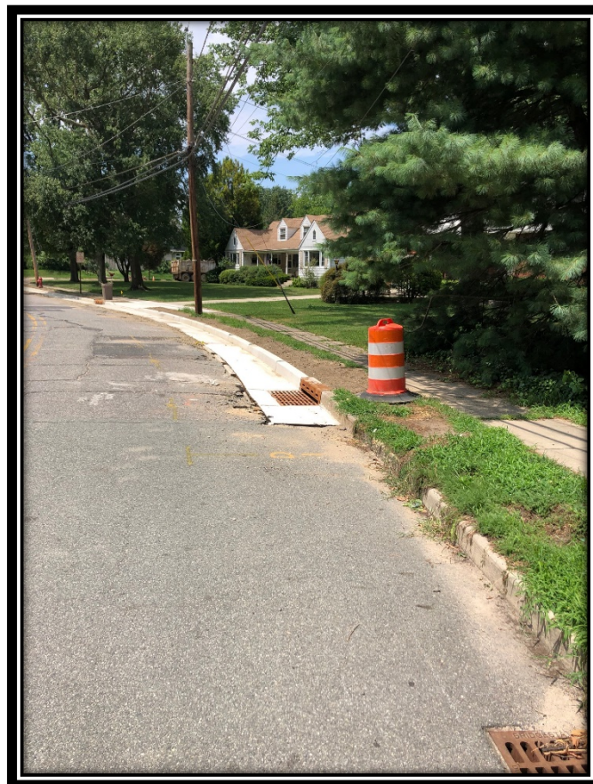
Figure 1: Completed curb, gutter and new inlets on Avondale Avenue.

Monday, July 8, 2019 to Saturday, July 13, 2019