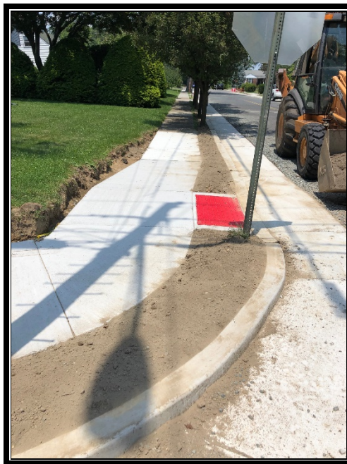
Figure 3: New sidewalk and handicap ramp at Avondale & Tomlinson Avenues.