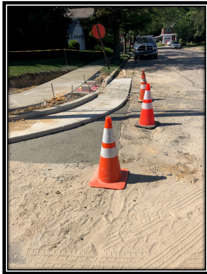
Figure 1: Replacement of concrete base course at each corner.

Monday, June 24, 2019 to Saturday, June 29, 2019