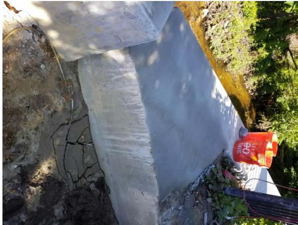
Concrete poured for North East side tie in