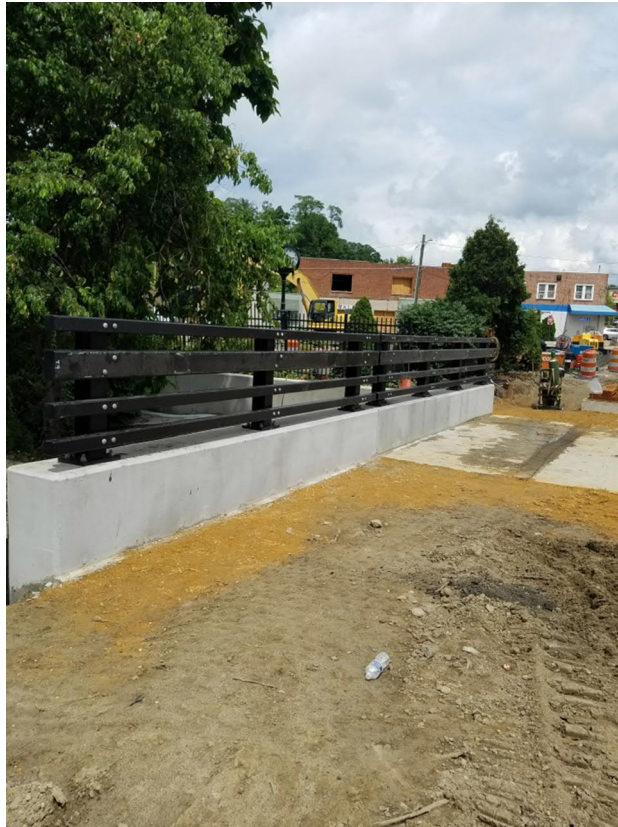
Installed railing on North side wing wall and headwall