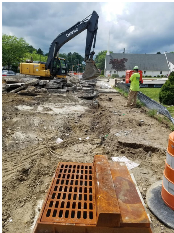
Basin frames and grates set