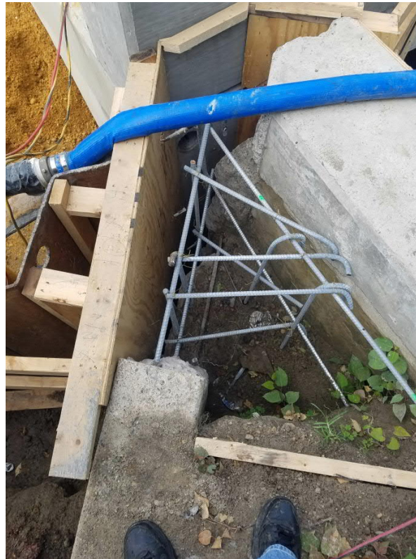
Forms built and rebar installed for tie in to existing wing wall

Borough of Clementon County of Camden, NJ Weekly Progress Report #35 June 17 to June 21, 2019