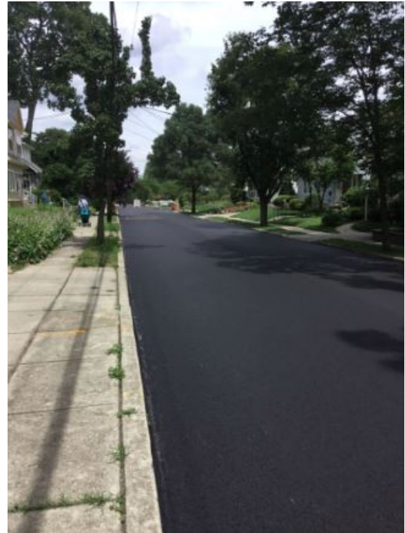
Figure 5: Top paving along Fern Ave