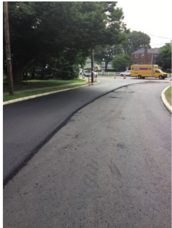
Figure 3: Top paving at Cuthbert Boulevard intersection