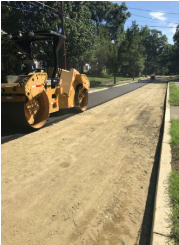
Figure 2: Base paving operations

APS will continue restoration work and install roadway signage along Fern Ave, possible concrete work at the intersection with Haddon Ave. HMA cores will be taken by the testing agency. Daily traffic control will continue to be implemented for the duration of the project.