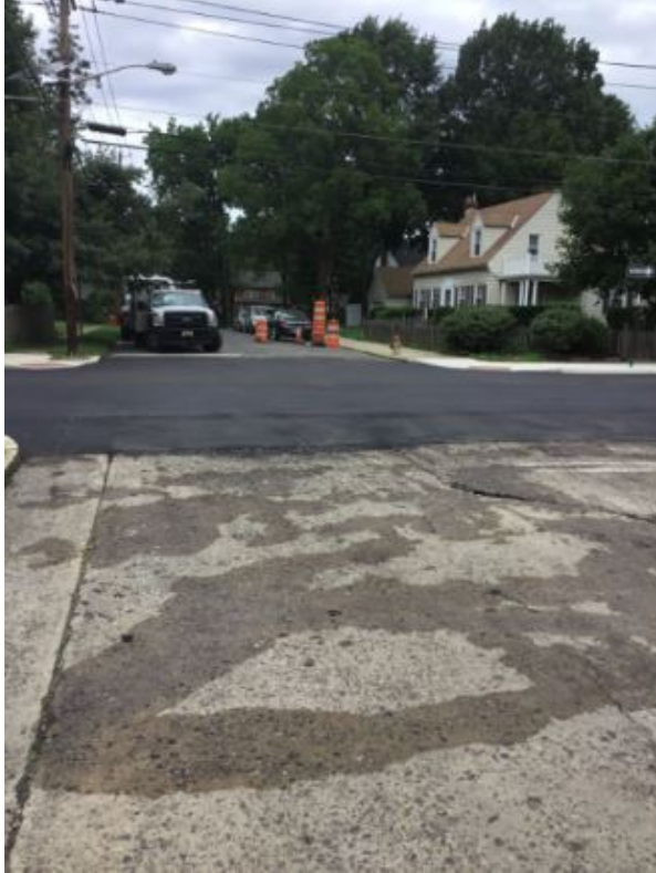
Figure 4: Top paving at Burrwood Ave intersection