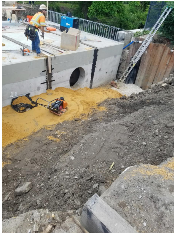
I - 9 backfill on North East side.