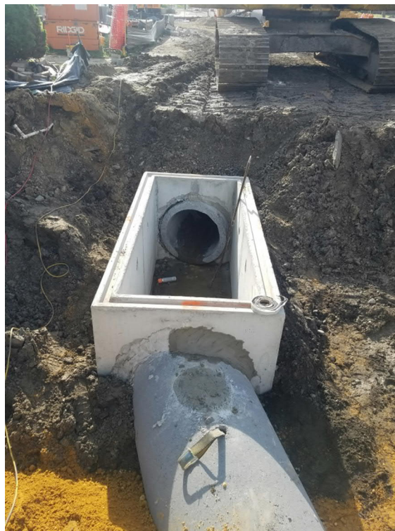
Inlet set and plumbed to existing drainage and to culvert