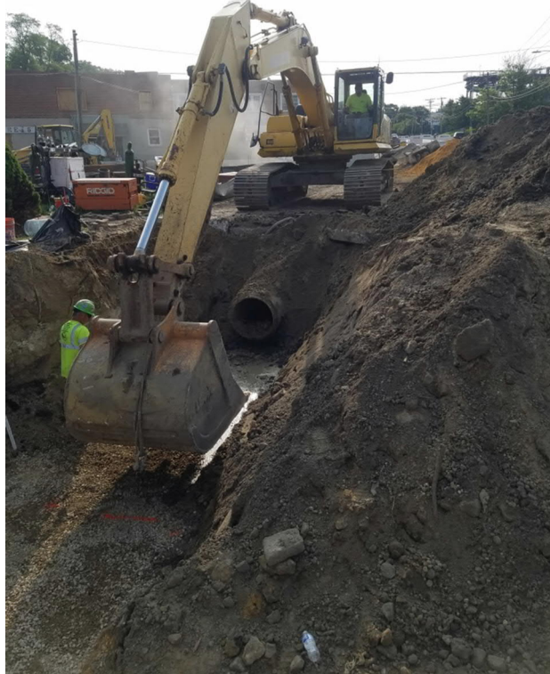
Excavation for new 30" drainage