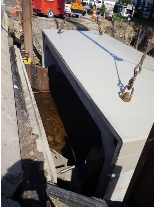
First of four units being set in place. Connectors attached to accept tensioning cable.