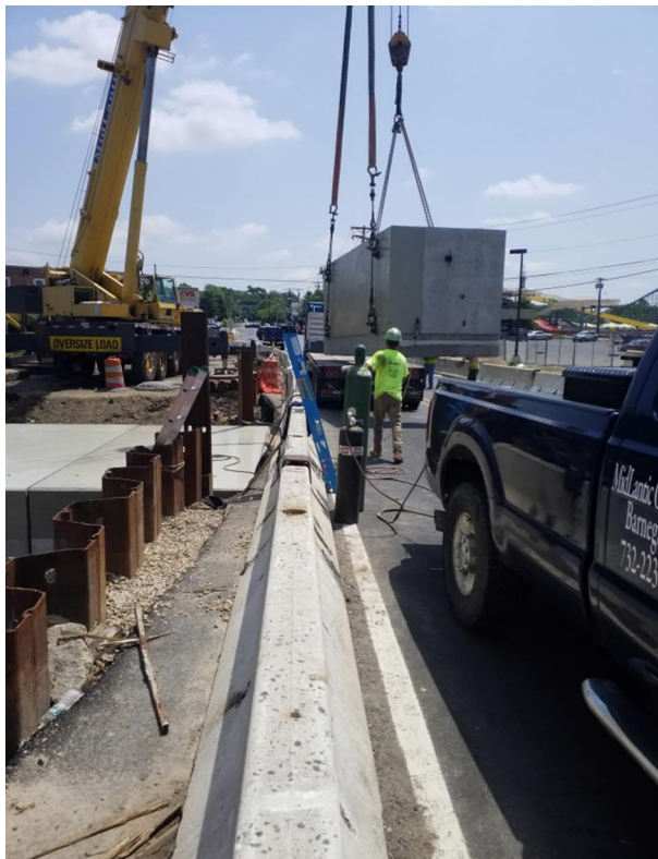
Unit being lifted off of flatbed trailer.