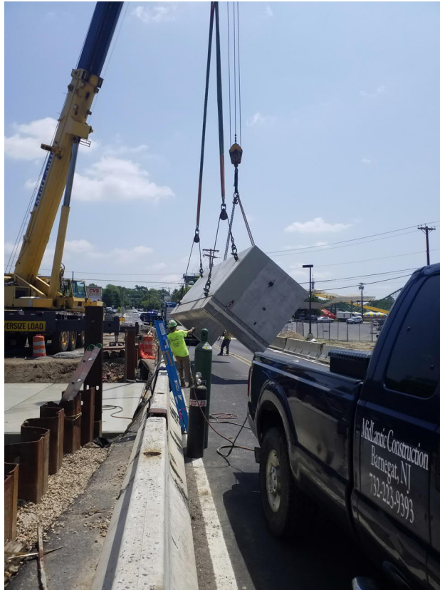
Once off the trailer, units are flipped upright.