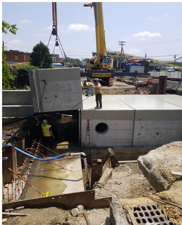
Last unit being installed.