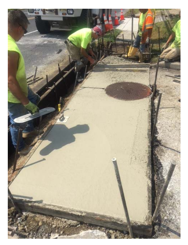
S:\Camden County\Project Files\HCM00603.01 - Haddonfield-Berlin Rd\Correspondence\19-06-03 Weekly Status Report WE 06-01-19.doc