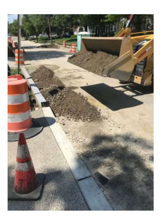
Figure 3: Concrete installed, temporary roadway restoration