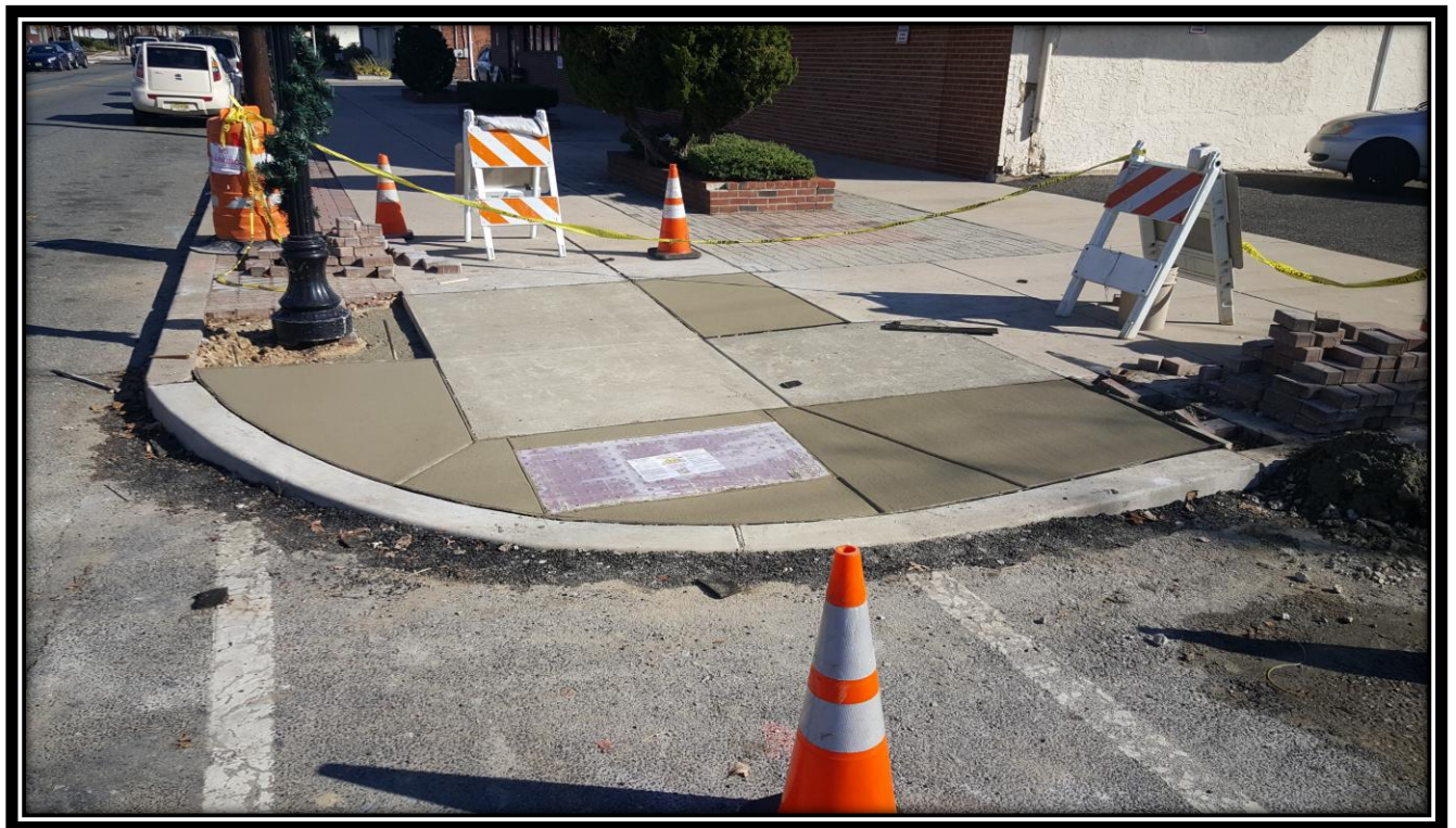
Figure: 1 – Installation of ADA ramp at the southeast corner of the intersection with 49 th Street along the eastbound lane