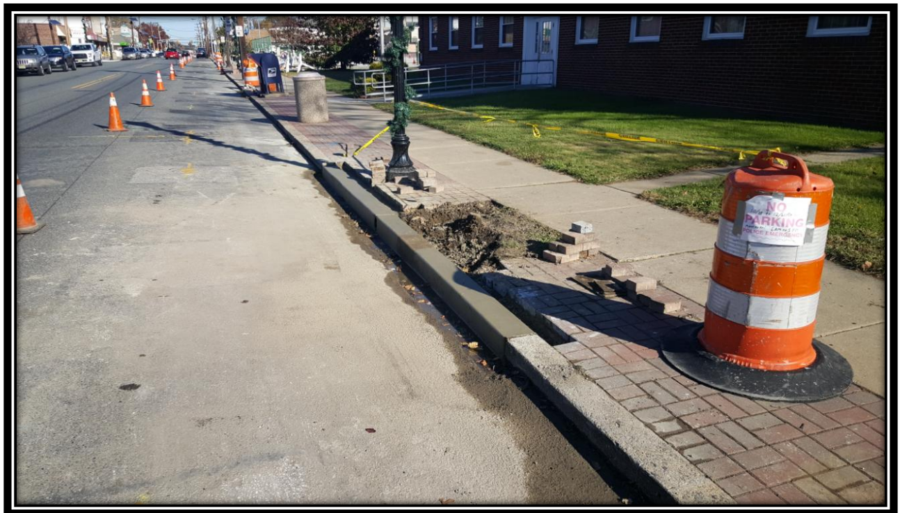
Figure: 3 – Installation of concrete curb between 47 th Street and 48 th Street along the eastbound lane