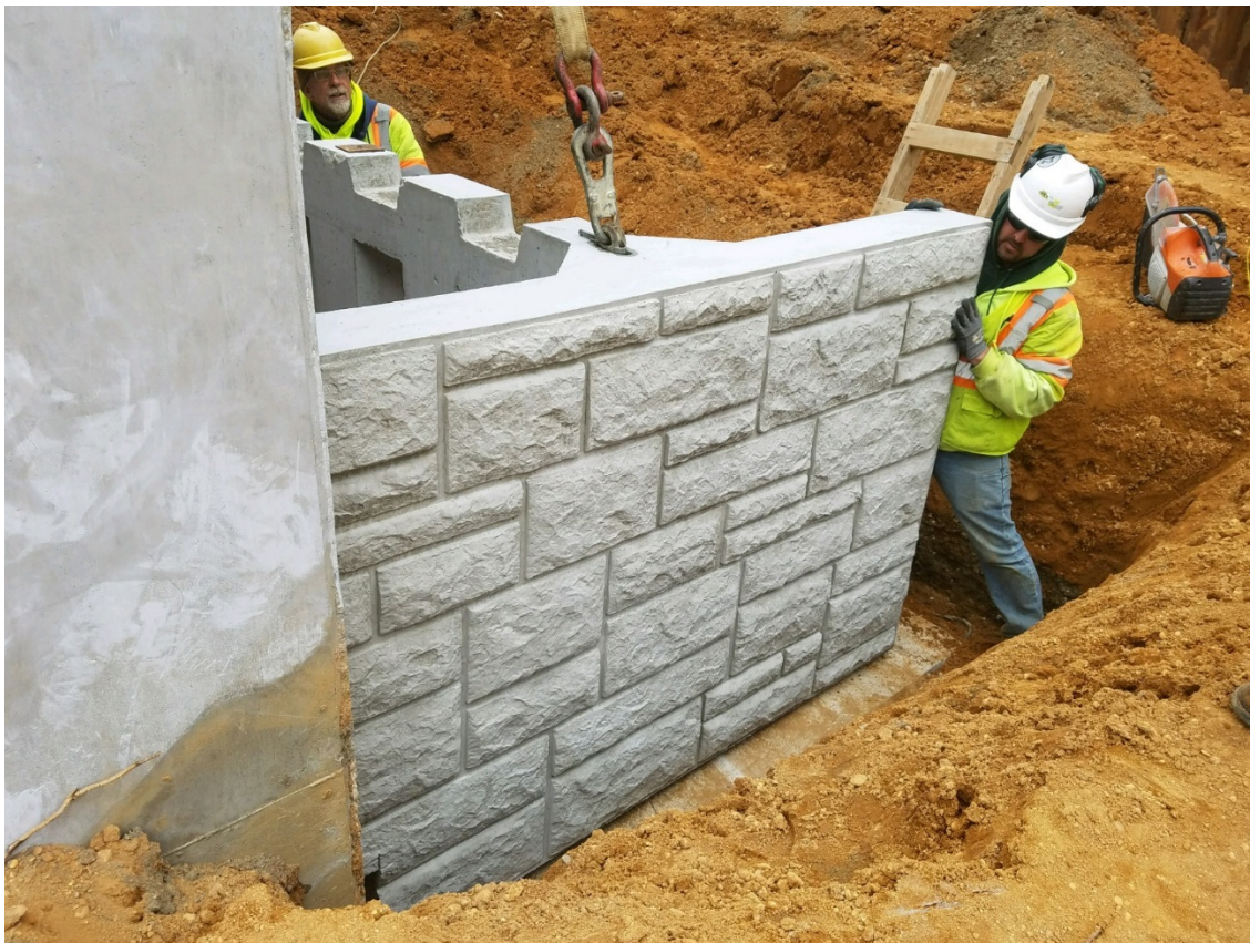
Figure 1 RE Pierson installing T-Wall section adjacent to NE Wingwal

Borough of Audubon County of Camden, New Jersey Weekly Progress Report Monday 04/16/2018 thru Friday 04/20/2018