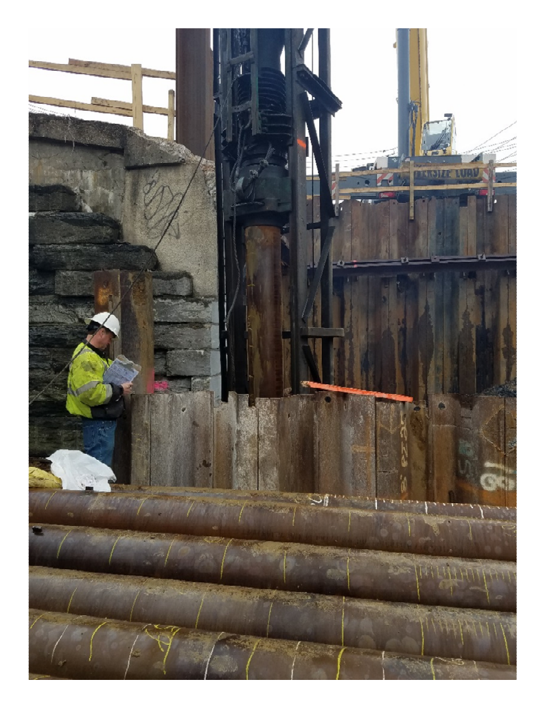
Figure 1 RE Pierson Driving Pipe Pile at North Abutment

Borough of Audubon County of Camden, New Jersey Weekly Progress Report Monday 02/12/2018 thru Friday 02/16/2018